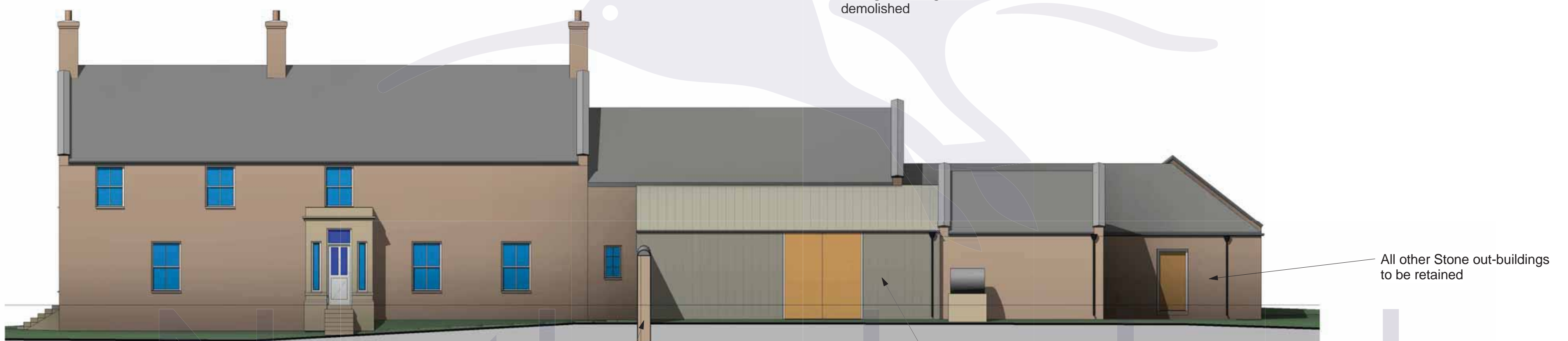
2 Existing East Elevation 1 : 100