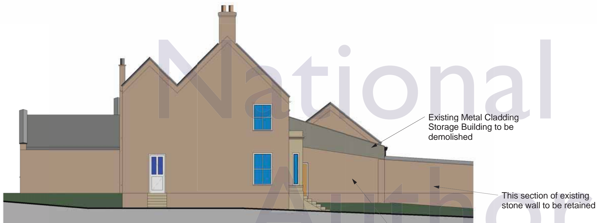
3 Existing South Elevation 1 : 100