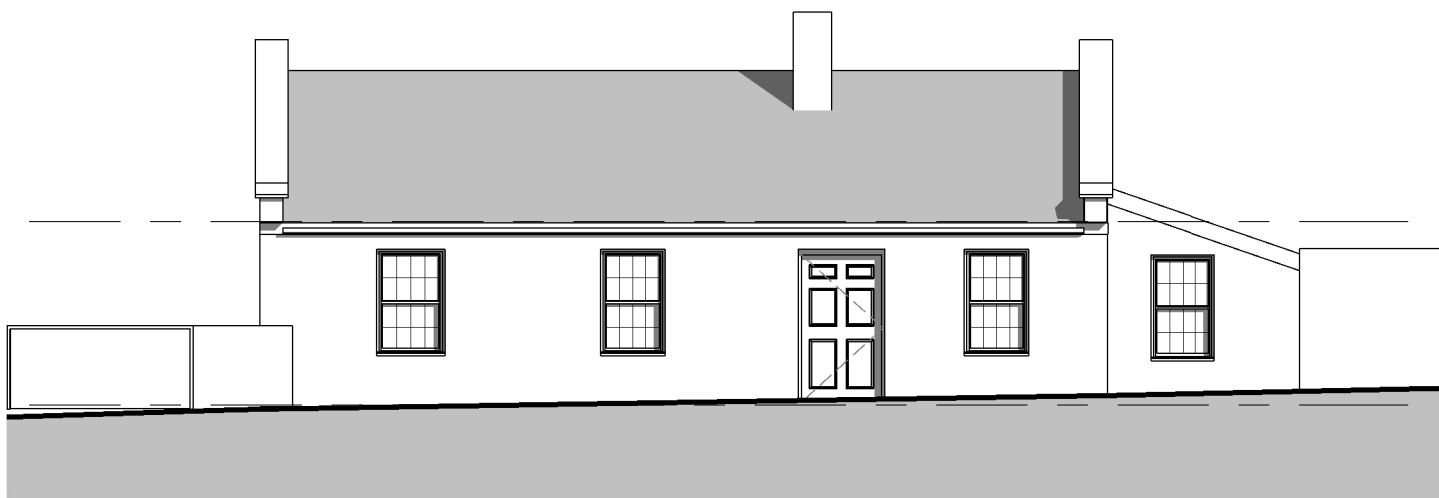
Proposed East Elevation