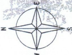
EXISTING SITE PLAN (1:100)