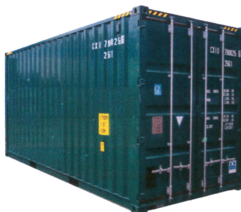
Typical 6.1m (20ft) shipping container