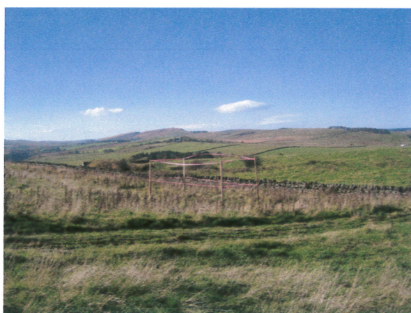
Proposed location of shipping container.