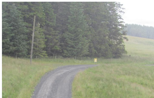
Location where the proposed road would meet existing forest road (looking west/east)

The track is 300 metres by 4 metres and would be constructed in a west-north-west direction from the existing road, utilising a small gap between existing areas of mature trees that are to be felled.