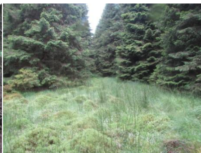
Existing views along proposed route

The supporting information confirms that the track would be built to the recognised Forestry Civil Engineering standards and specifications. The track would have a sandstone base, with a grey stone used for the surface areas of the track.