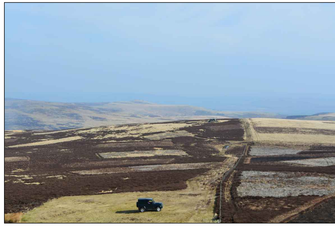
Parking area pre construction (i)