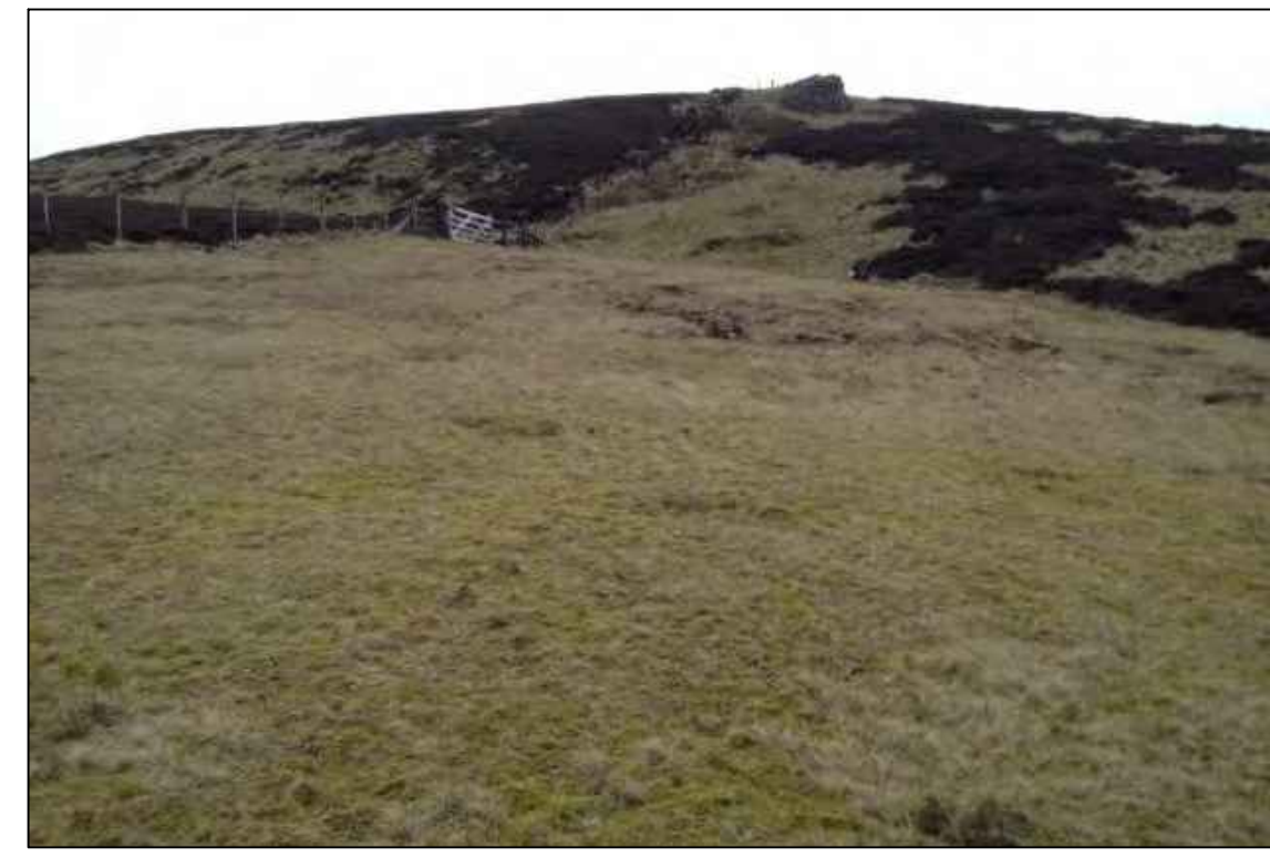
Parking area pre construction (ii)