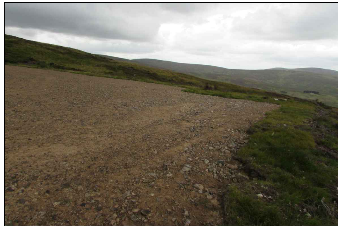
Parking area as existing (iii)