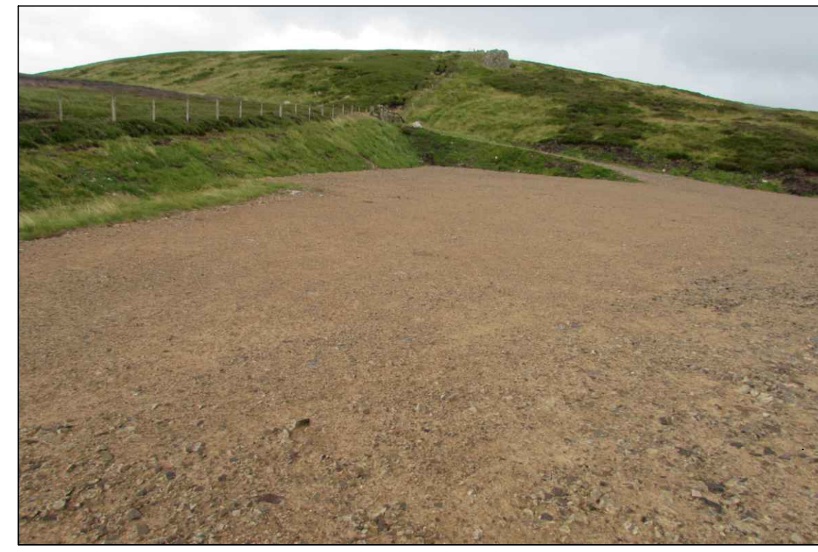
Parking area as existing (iv)