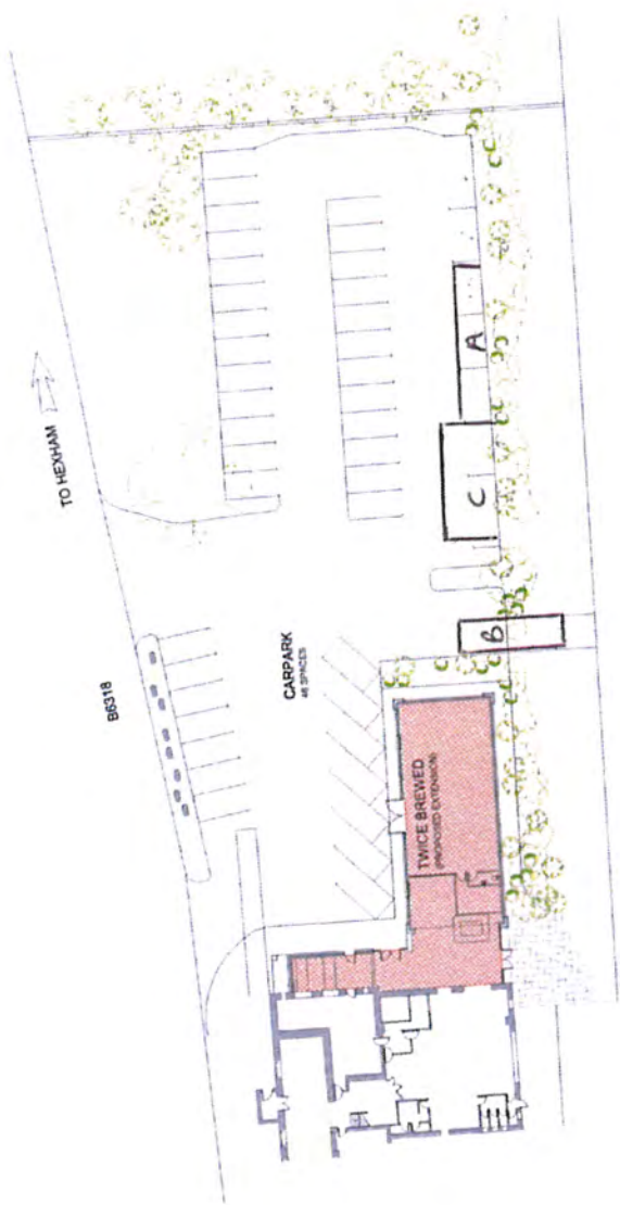
PROPOSED SITE LAYOUT Scale 1:200