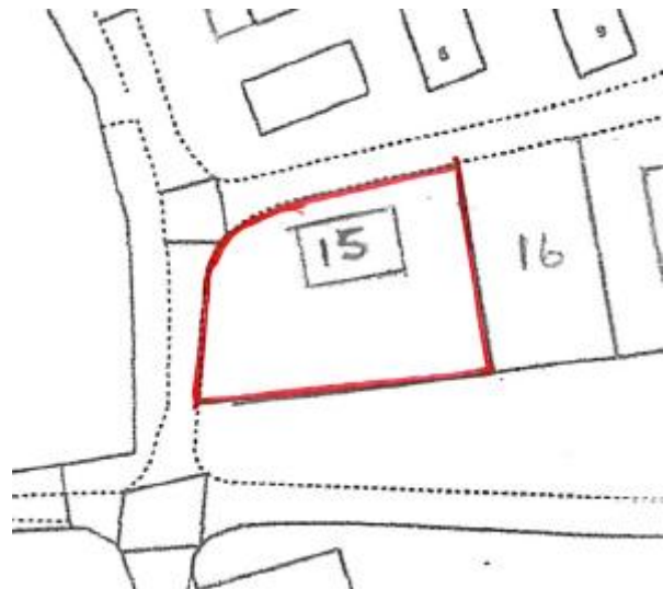
Right: Proposed location plan

Subject to an assessment of the proposed development in terms of any impact upon the special qualities of the National Park and having regard for this fall-back position it is considered that the proposed construction of a chalet in this location would meet with the provisions of Core Strategy policy 5.