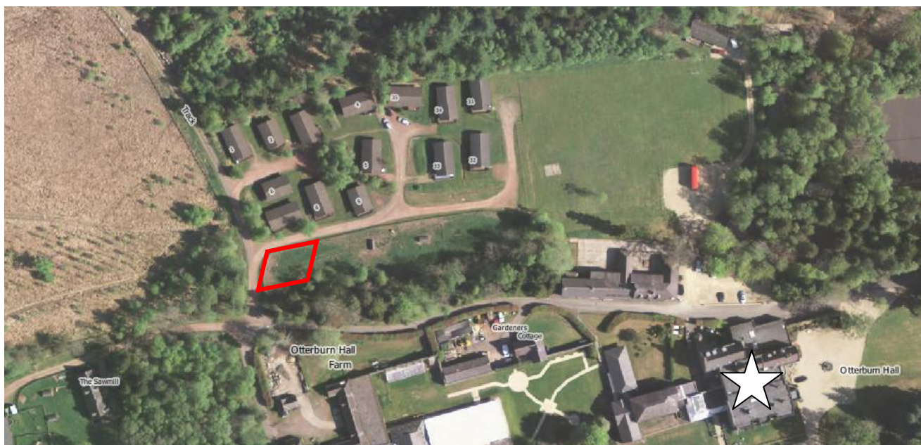
Aerial view of Otterburn Hall and 'top site'. Approximate position of site outlined in red. Otterburn Hall annotated with star. Partially-built chalets now covering formerly vacant land

The top site is located to the northern part of the Otterburn Hall Estate. The site is surrounded by mature trees and separated from the Hall itself by the Estate driveway which runs beyond the southern site boundary. The proposed chalet would be located to the south western part of the site; this is bounded to the south by a copse of mature trees, with existing and now partially-built chalets to the north and east.