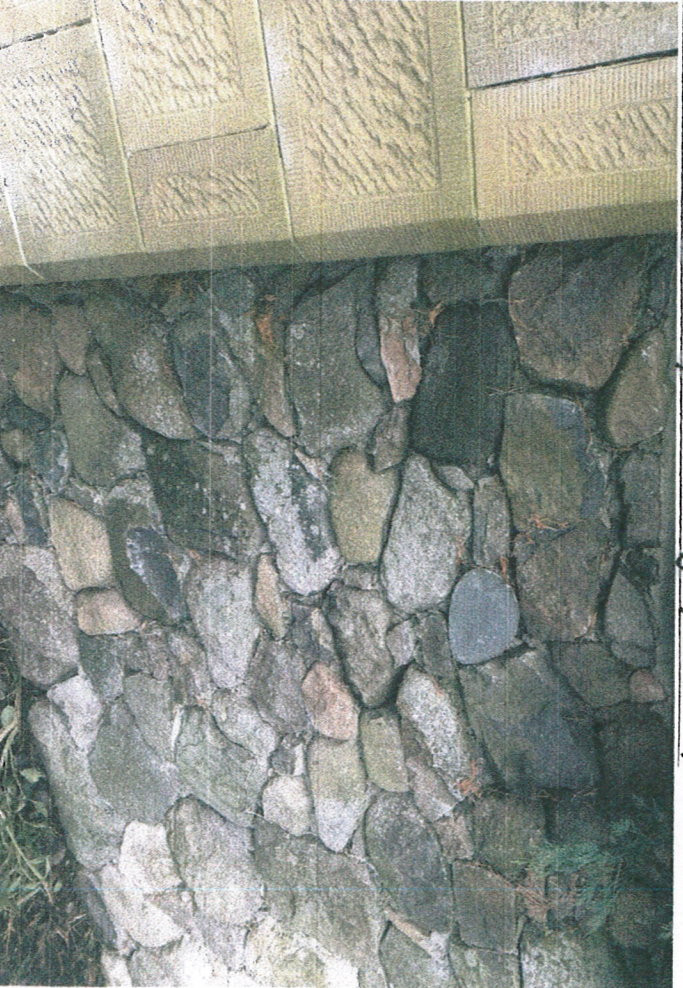
REDEM - WOODER DEMOLITION CONTRACTORS - TYPE OF STONE AVAILABLE