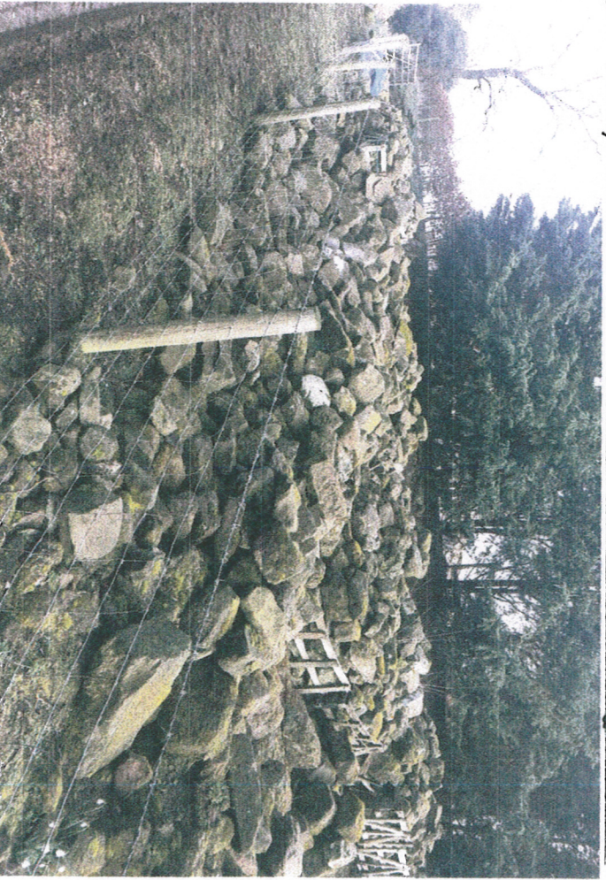
REDDEM - WOODLER AVAILABLE RECLAIMED STONE FROM DOBINGTON, WOODLER.