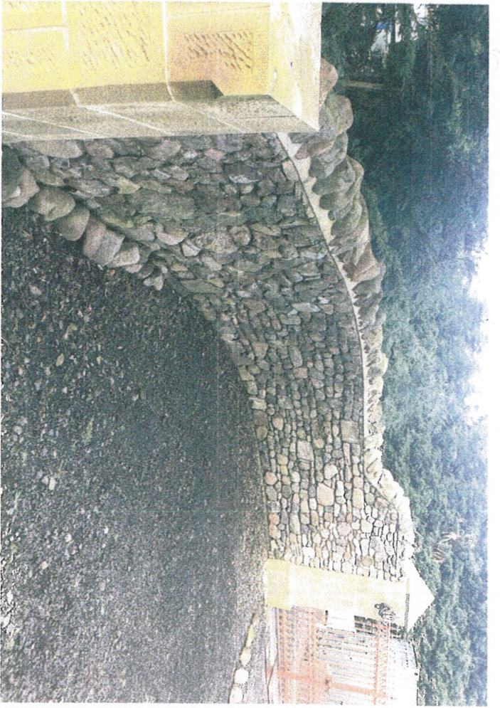
COLOR/STYLE OF STONE