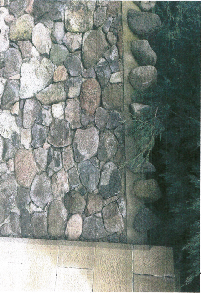
COLOR/STYLE OF STONE. THOMPSON