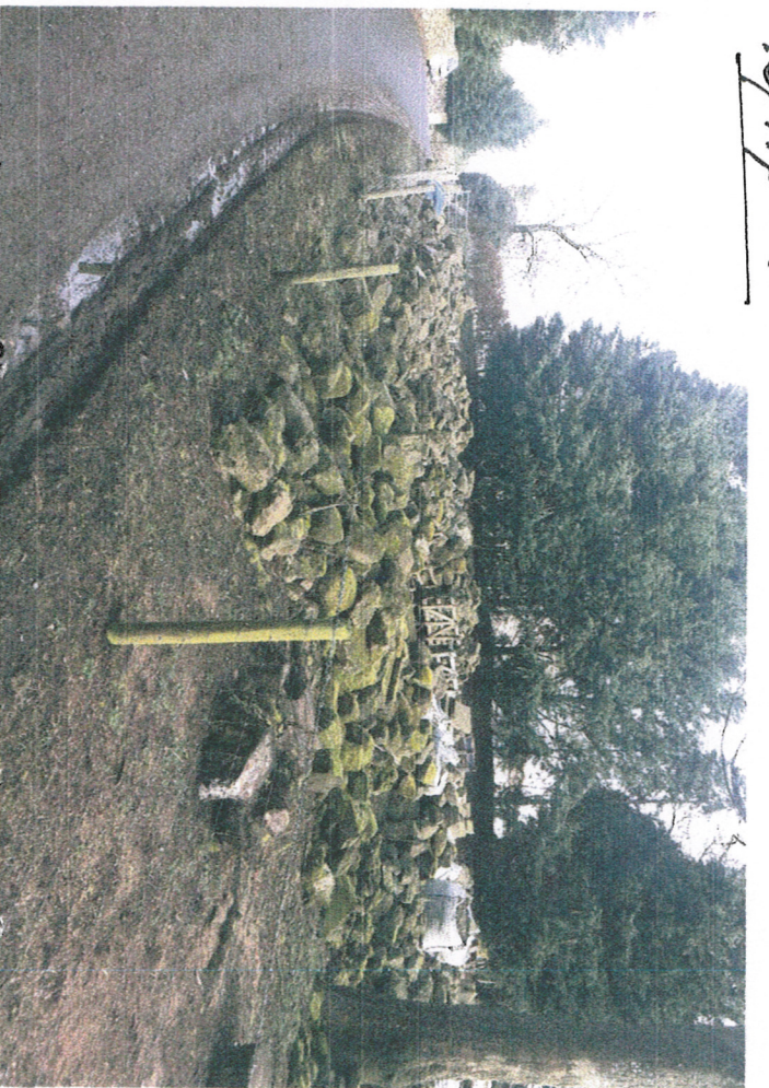
TRAMPSONS WALLS - FARMHOUSE / OUTBUILDINGS WALLS.