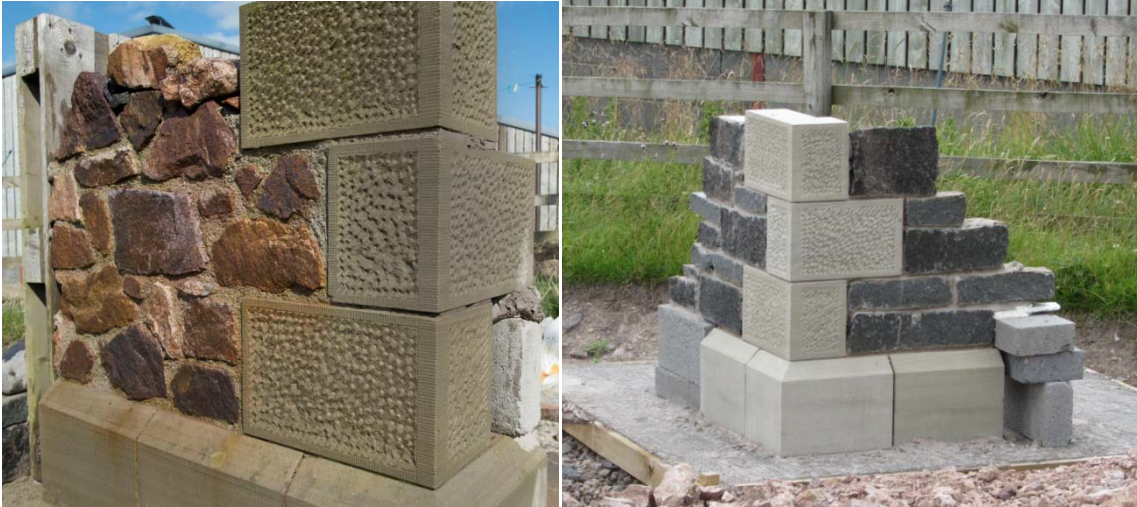
Photographs showing the weathering of the Swinton stone quoins over time on the application site (left, application submission April 2017 – right, site photo August 2015)

The Swinton sandstone is also locally sourced natural stone, and although it has a very bright and light coloured appearance initially, photographs of the sample panels left on the site indicate that the colour of this stone dulls very quickly in the local climate, on this particularly exposed site.