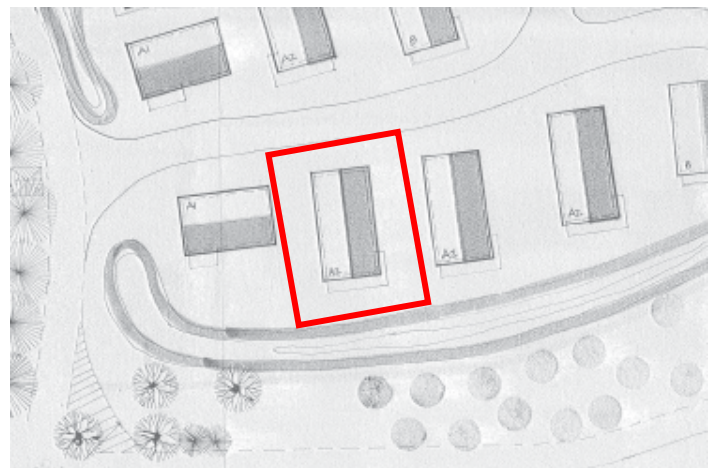
Right: Site plan approved under 87NP0031

Subject to an assessment of the proposed development in terms of any impact upon the special qualities of the National Park and having regard for this fall-back position it is considered that the proposed construction of a chalet in this location would meet with the provisions of Core Strategy policy 5. Policies 14 and 15 of the Core Strategy and NPPF Paragraph 28 also provide support for the proposed development in this case, advocating economic development and tourism development in rural areas. It is however necessary to attach a condition to any planning approval restricting the occupancy of the proposed unit to holiday use only, with a further limitation on the occupancy of the chalet between 15 th January and 15 th February in each year, as the creation of permanent residential accommodation in this location would conflict with Core Strategy policies 5, 9