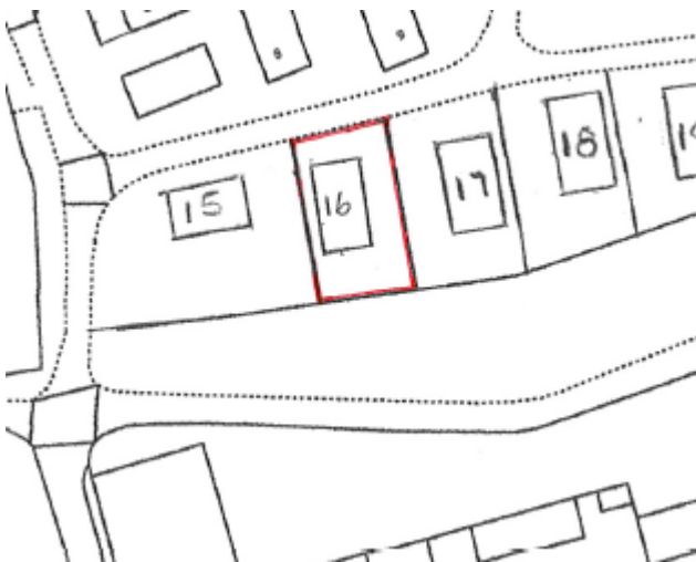
Left: Proposed location plan

The proposed development would sit alongside the existing holiday chalets approved on this top site under 87NP0031. It is recognised that a number of chalets granted planning permission under this application have not yet been constructed; however as the development was commenced within the time-frame permitted, the fall-back position of this application is the chalet previously approved in the approximate position as that proposed by this application. This previously-approved chalet is shown in the plan below alongside the position of the chalet presently proposed. In this way, it is considered that the previous development approved under 87NP0031 sets a precedent for the type of development on this top site both in terms of the type of development over the wider top site, and also the specific chalet approved on plot 16.