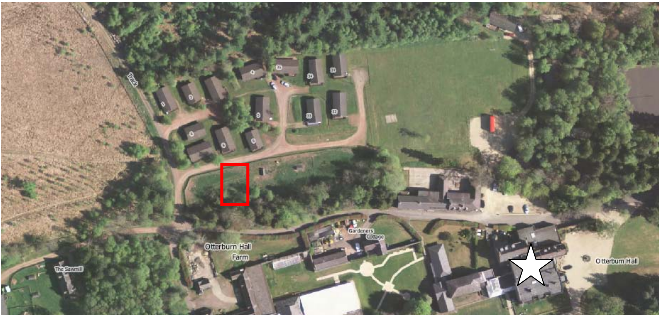
Aerial view of Otterburn Hall and 'top site'. Approximate position of site outlined in red. Otterburn Hall annotated with star. Partially-built chalets now covering formerly vacant land

The top site is located to the northern part of the Otterburn Hall Estate. The site is surrounded by mature trees and separated from the Hall itself by the Estate driveway which runs beyond the southern site boundary. The proposed chalet would be located to the south western part of the site; this is bounded to the south by a copse of mature trees, with existing and now partially-built chalets to the north, east and west ( chalets to north east, east and west not shown on photograph below ).