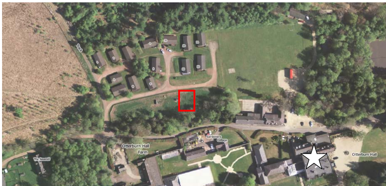
Aerial view of Otterburn Hall and 'top site'. Approximate position of site outlined in red. Otterburn Hall annotated with star. Partially-built chalets now covering formerly vacant land

The top site is located to the northern part of the Otterburn Hall Estate. The site is surrounded by mature trees and separated from the Hall itself by the Estate driveway which runs beyond the southern site boundary. The proposed chalet would be located to the southern part of the site; this is bounded to the south by a copse of mature trees, with existing and now partially-built chalets to the north, east and west ( chalets to north east and west not shown on photograph below ).