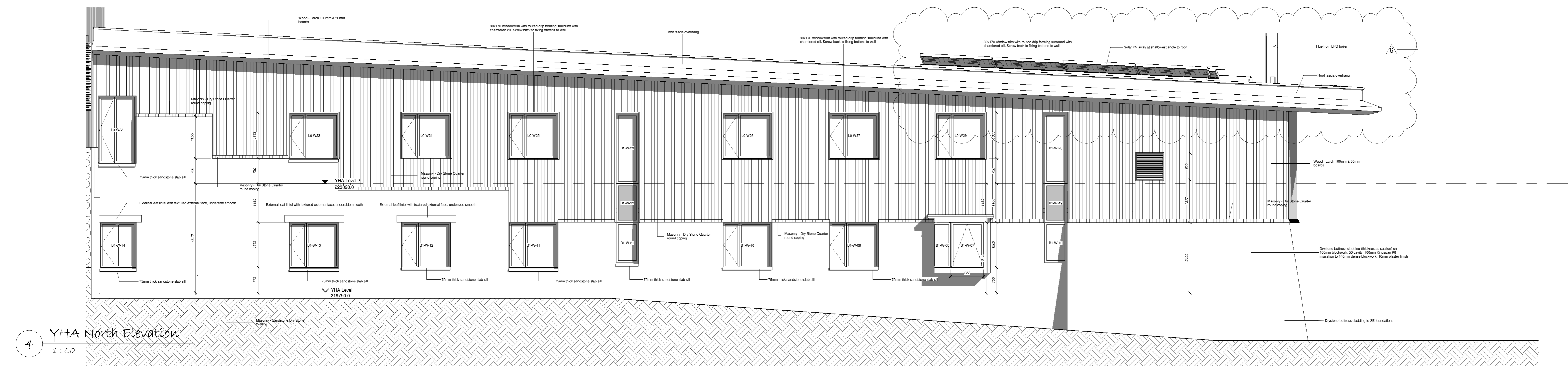
4 YHA North Elevation 1 : 50