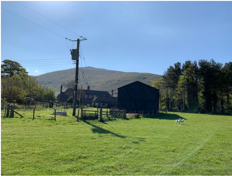
View south east towards the existing hayshed and the cottages, with the site to the right.