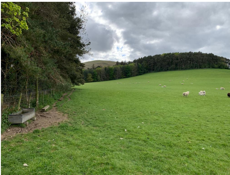
View of the site with the conifer wood on the left.