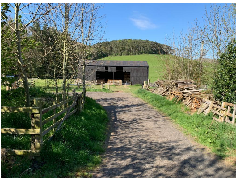
View from the road south west towards the existing hayshed with the site beyond.