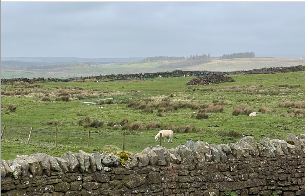
Photo 3: North west with archaeologists currently on site at Milecastle 46.