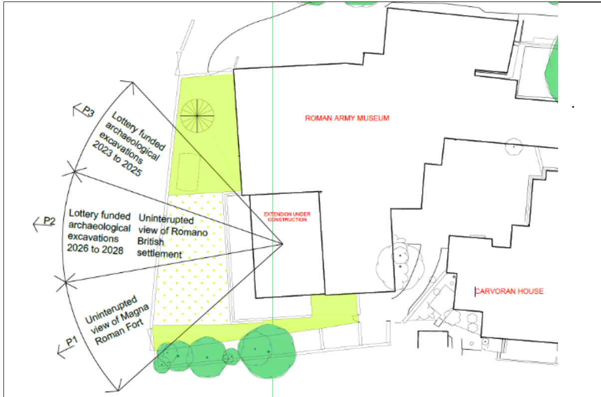
Diagram showing views from within the new extension of the historic site and the excavations currently underway.

These views are an essential part of the design to provide a viewing point to the public to better understand the Roman way of life and to see at first hand the archaeological excavations.