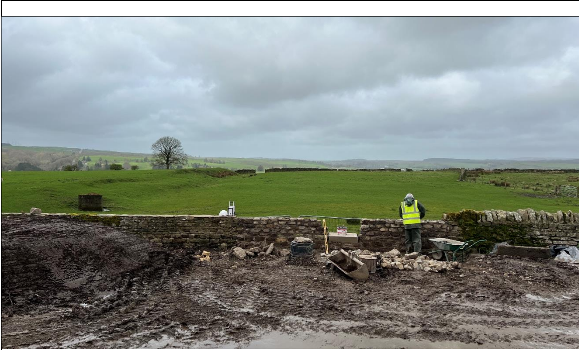
Photo 2: view west, the site of the Romano British settlement associated with the Roman Fort.