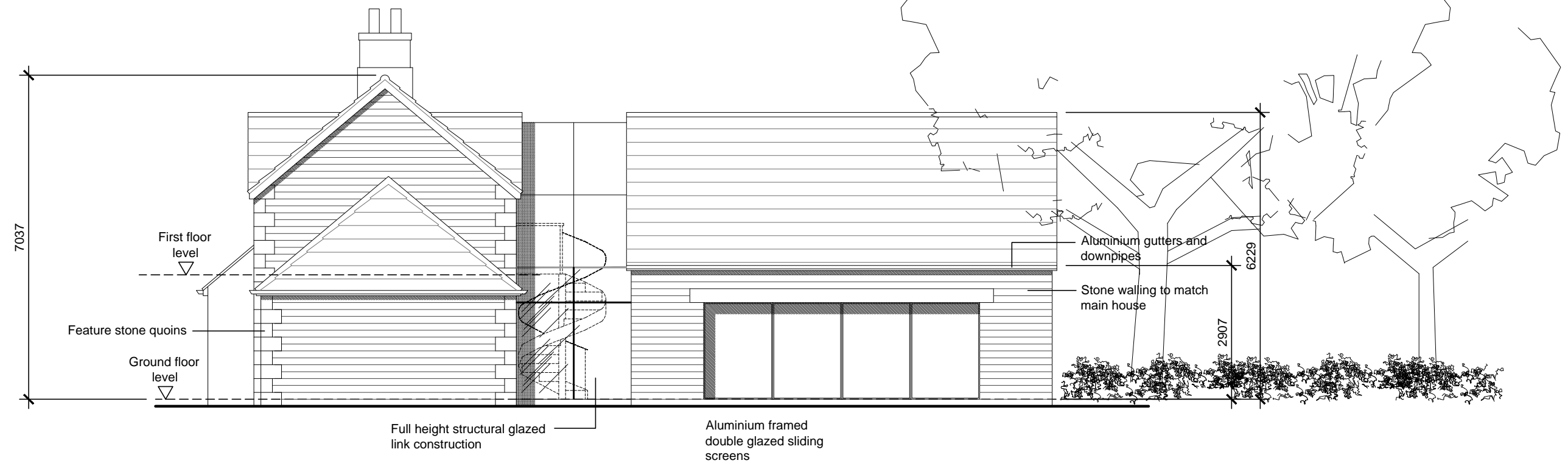
PROPOSED NORTH-EAST ELEVATION