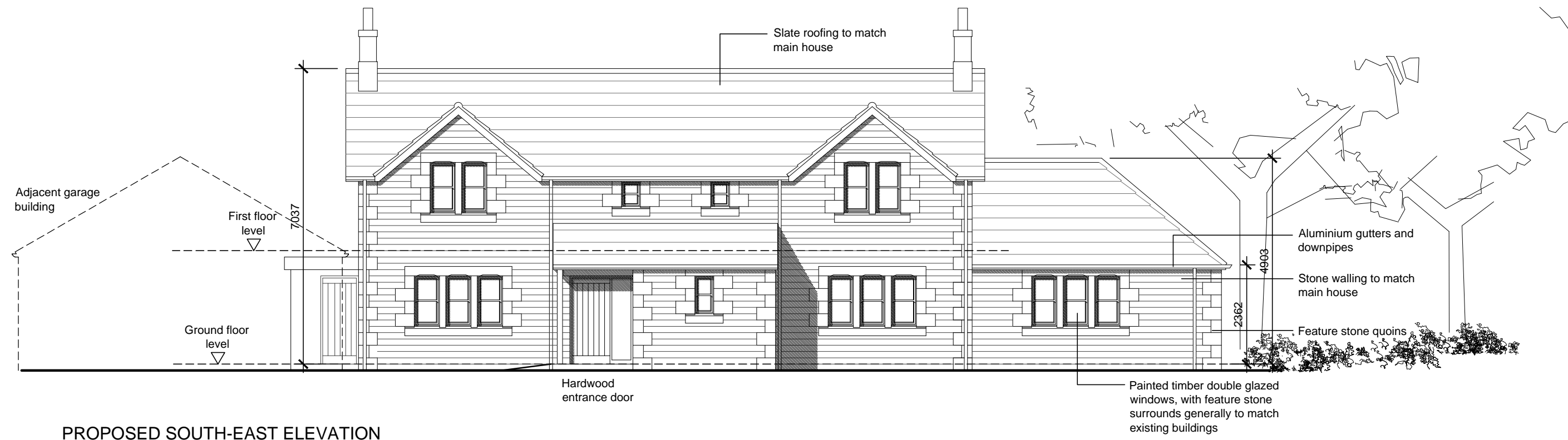
PROPOSED SOUTH-EAST ELEVATION (facing stable courtyard)