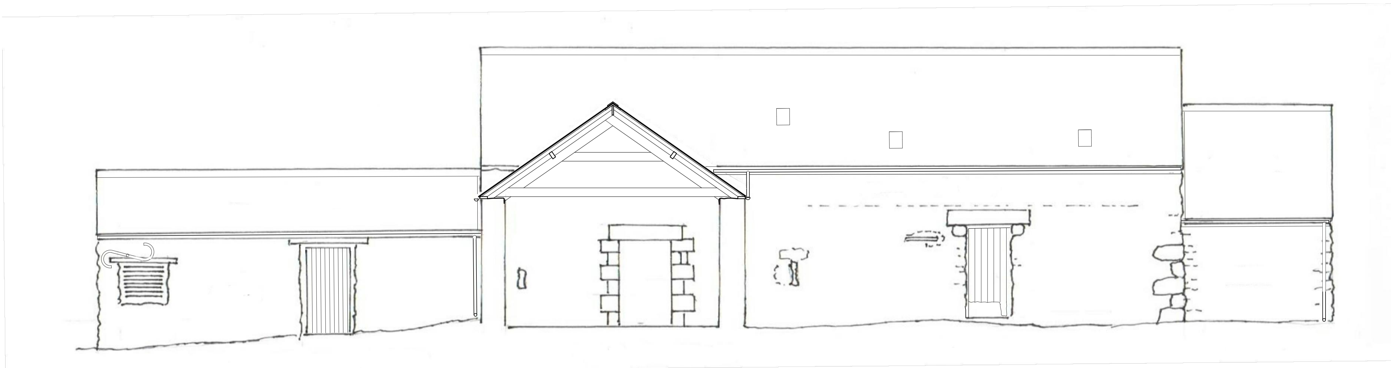
WEST ELEVATION WITH SECTION THROUGH THE REAR RANGE 1:50