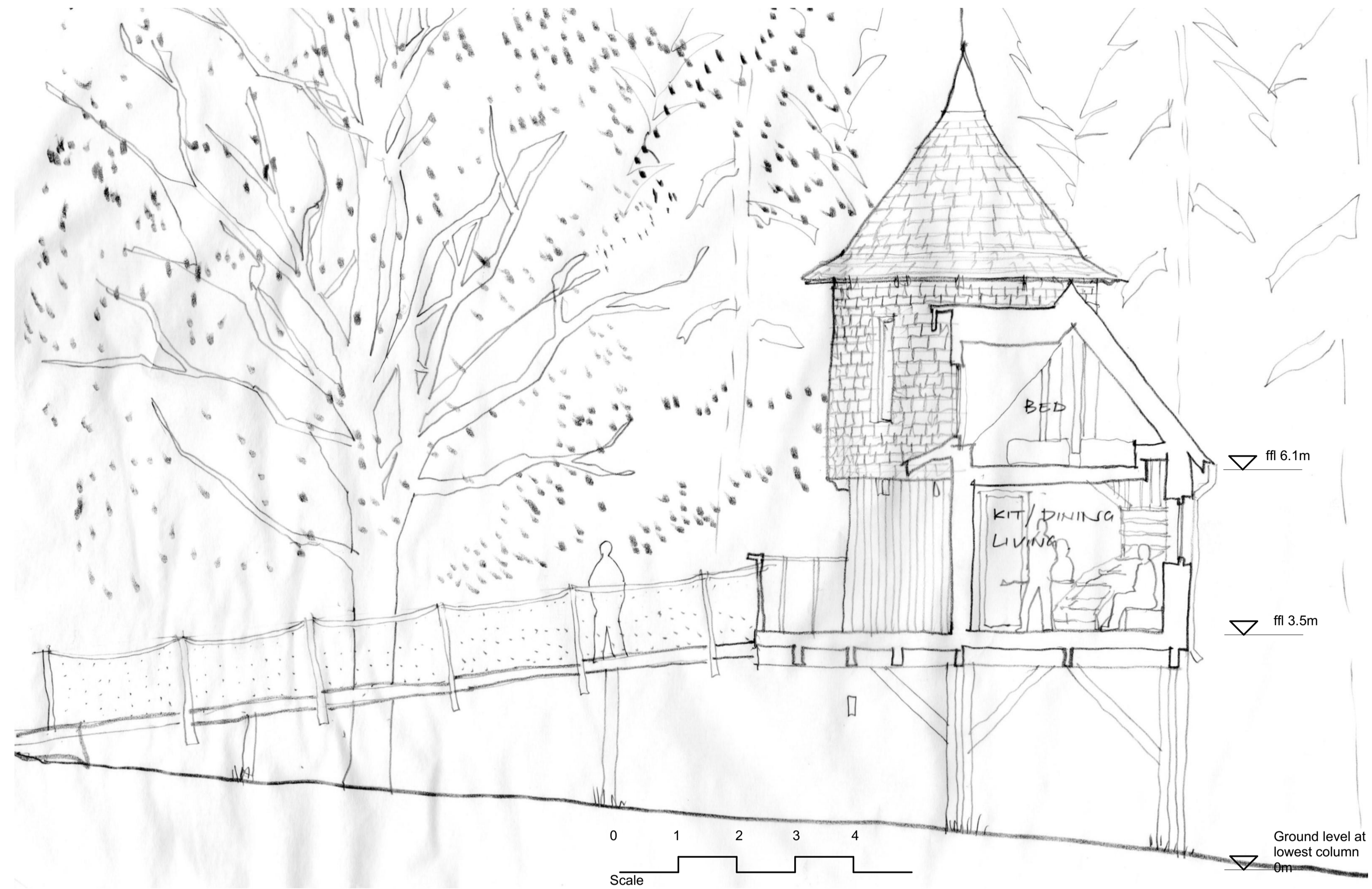
Building Section 2