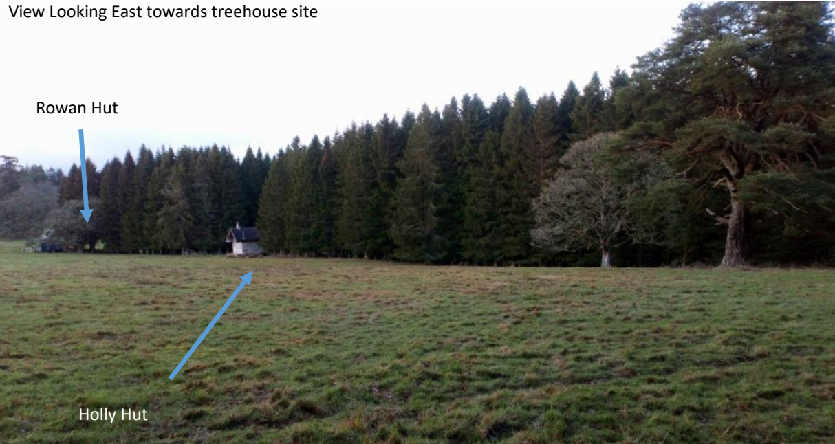
View Looking East towards treehouse site