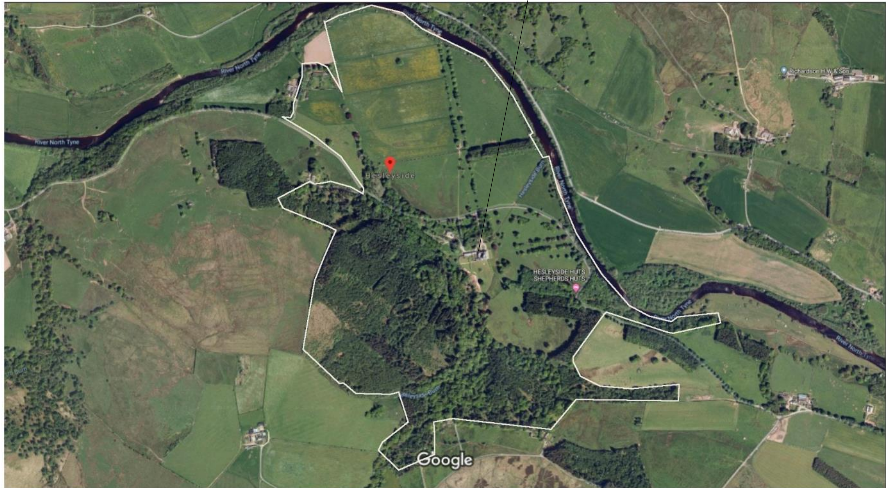
Aerial Photo showing extent of parkland