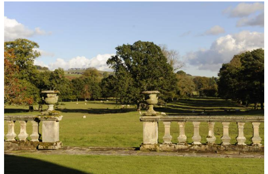
Views from East front towards Eastern Avenue