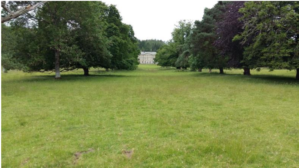
3 Principle view Eastern Avenue