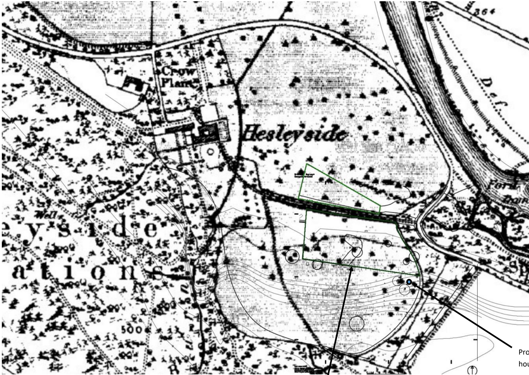
EXTRACT OF 1866 MAP

C20th Conifer plantation effectively cutting this part of the park off from the rest of the parkland