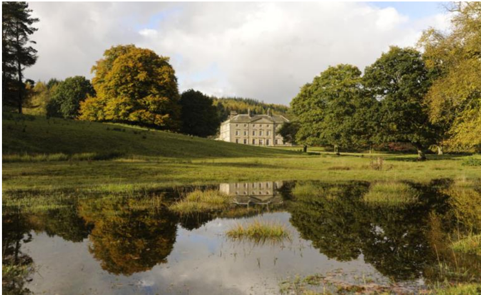
View from within the inner parkland boundary looking towards the south east corner with the Eastern Avenue to the right