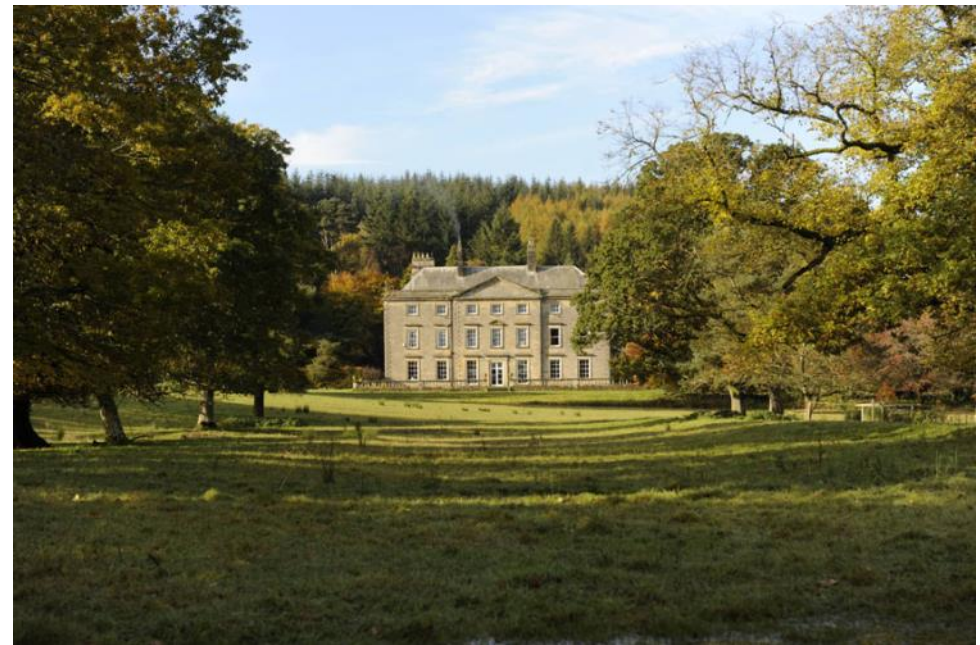
Principle Elevation: East Front from Easter Avenue

Sequential historic maps from 1865 onwards suggest that the plan layout of the parkland seen today follows closely that of the layout from that date. Caveats to this statement are the addition of 1960s monoculture conifer plantations to the south east of the avenue leading to the north east corner of the hall and the linear plantation to the north east of the Hall in the outer parkland. The conifer plantation to the south east of the parkland serves to cut this part of the parkland off from the rest of the setting.