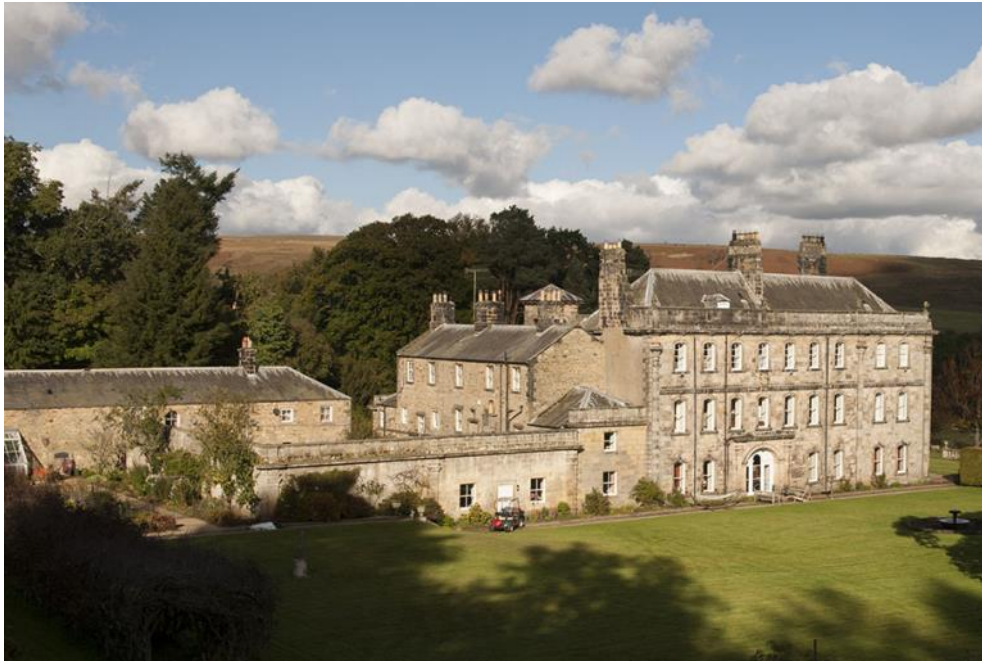
More private South Elevation