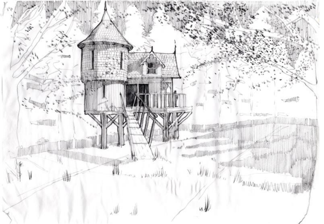
Views of treehouse Proposal