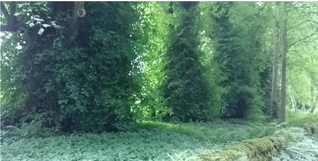
Lime Avenue leading from Mantel Hill entrance