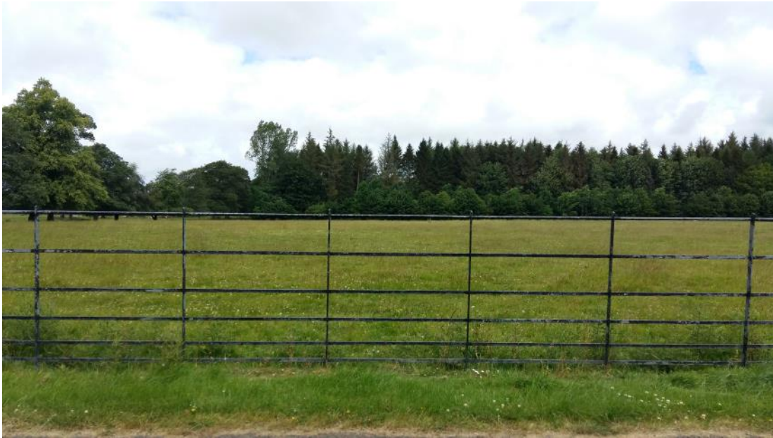
View from C200 looking north east towards line of conifer trees from the