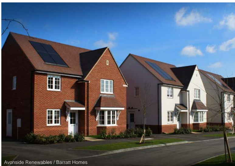
Avonside Renewables / Barratt Homes