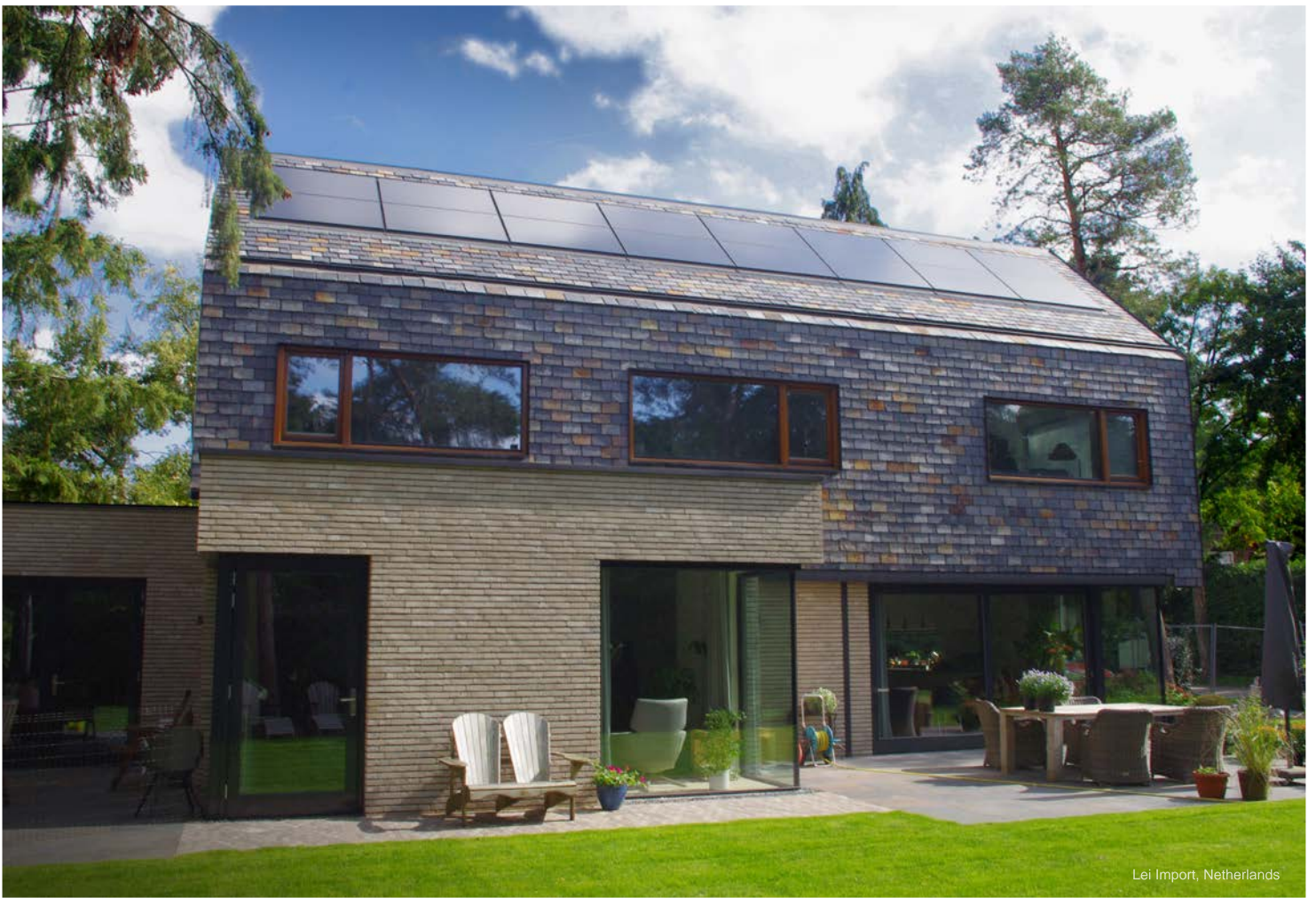
Lei Import, Netherlands