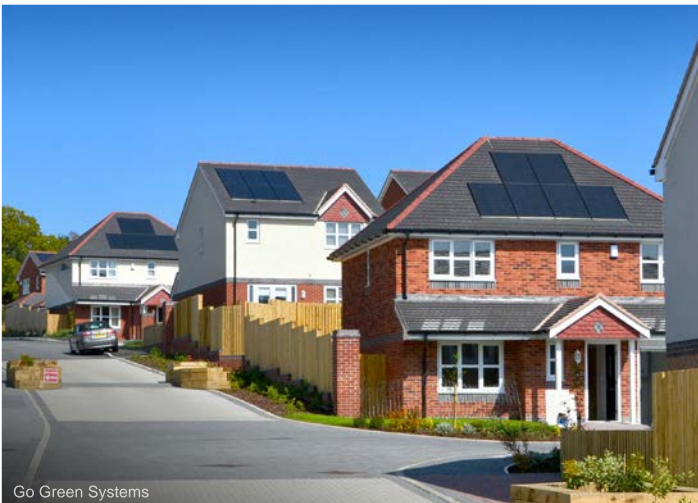
Go Green Systems