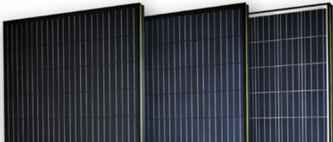
Available in a range of panel power output and styles