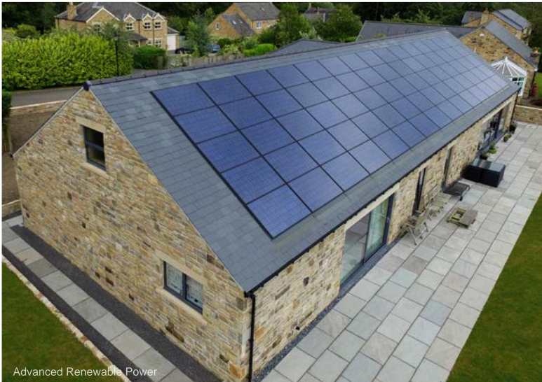
Advanced Renewable Power