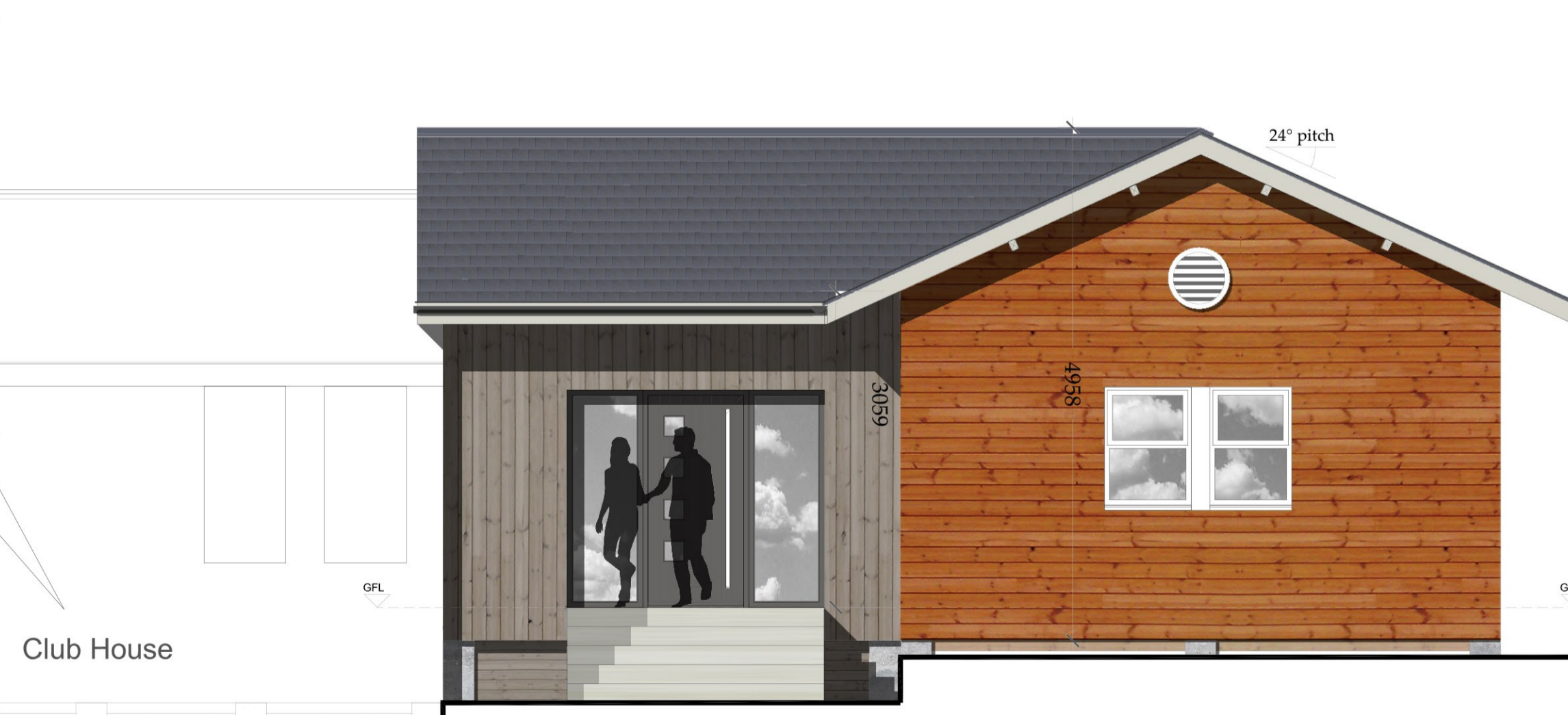
19THB (GA) 22 Proposed North Elevation