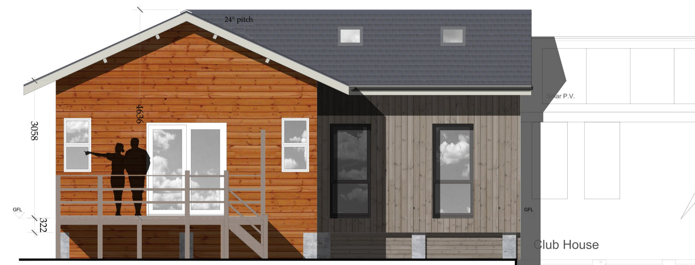
19THB (GA) 24 Proposed South Elevation