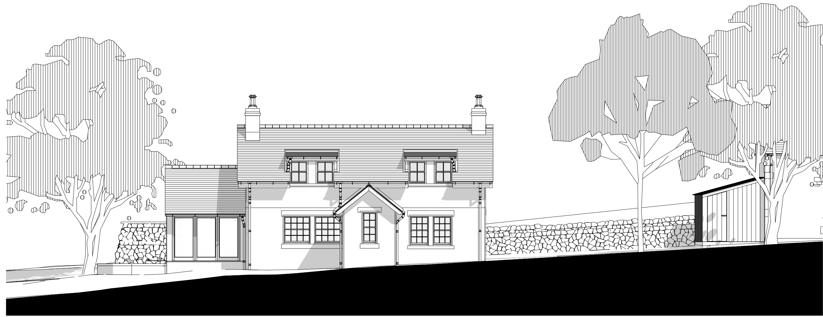
1 EXISTING FRONT ELEVATION 12 SCALE - 1:100