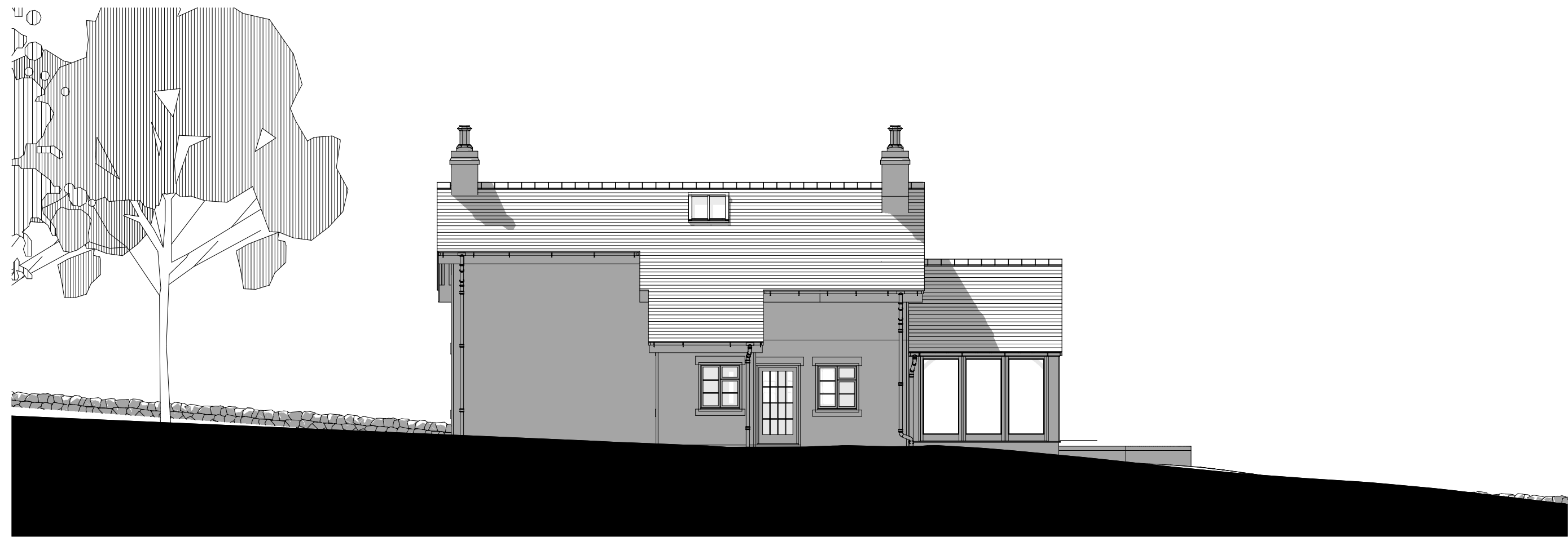
3 EXISTING REAR ELEVATION 12 SCALE - 1:100