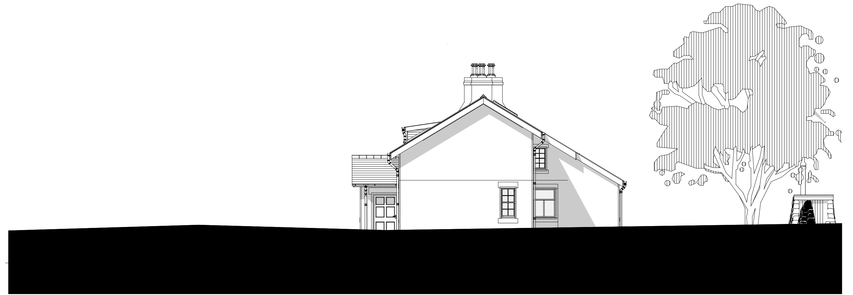
2 EXISTING SIDE ELEVATION 12 SCALE - 1:100