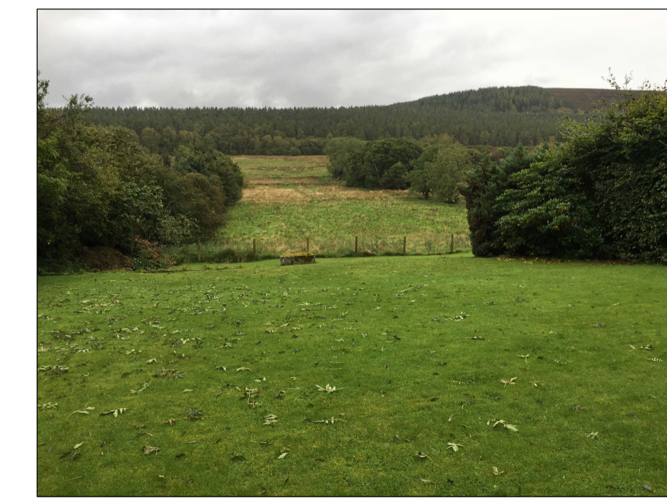
Far reaching view to South from existing Summerhouse. Note restricted views to East and West due to high hedges along boundaries