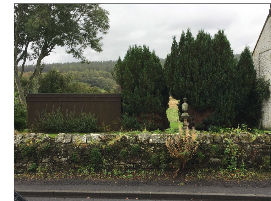
View looking South at main summerhouse frontage onto road. Gable end of The White House visible to the right of the photograph