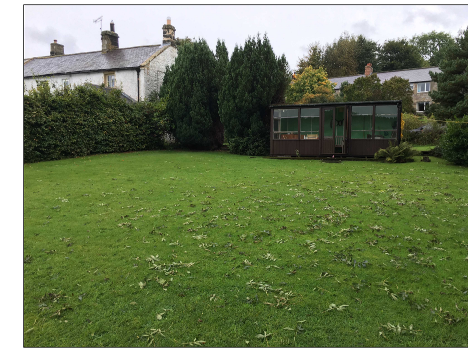
View from garden looking North-West towards existing Summerhouse and The White House next door. Note high hedge which separates properties

Accuracies are commensurate with the stated scale of the survey.