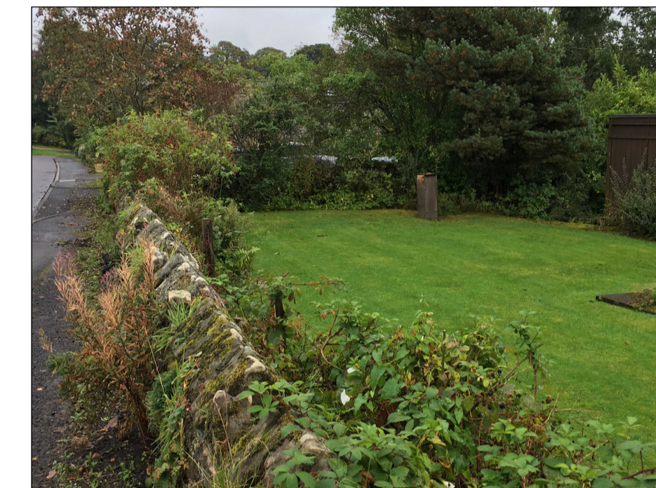
View looking East along footpath immediately to the North of the site. Existing summerhouse just visible to the right of the photograph