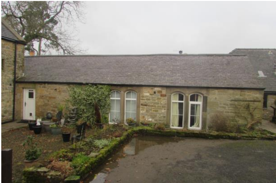
Figure 2: Front elevation of The Byre