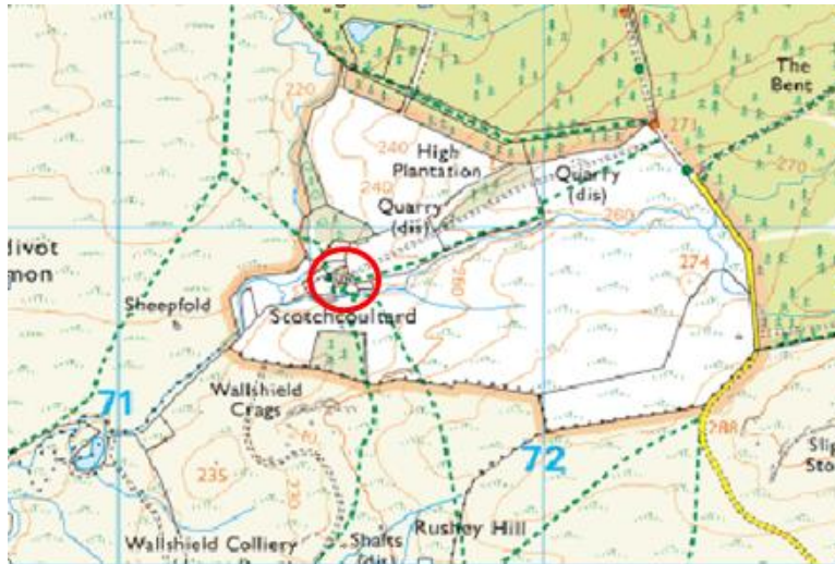
Figure 1: Scotchcoulthard in its immediate setting