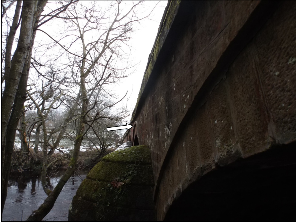
Photograph 3 – Bulging spandrel wall above west pier upstream elevation