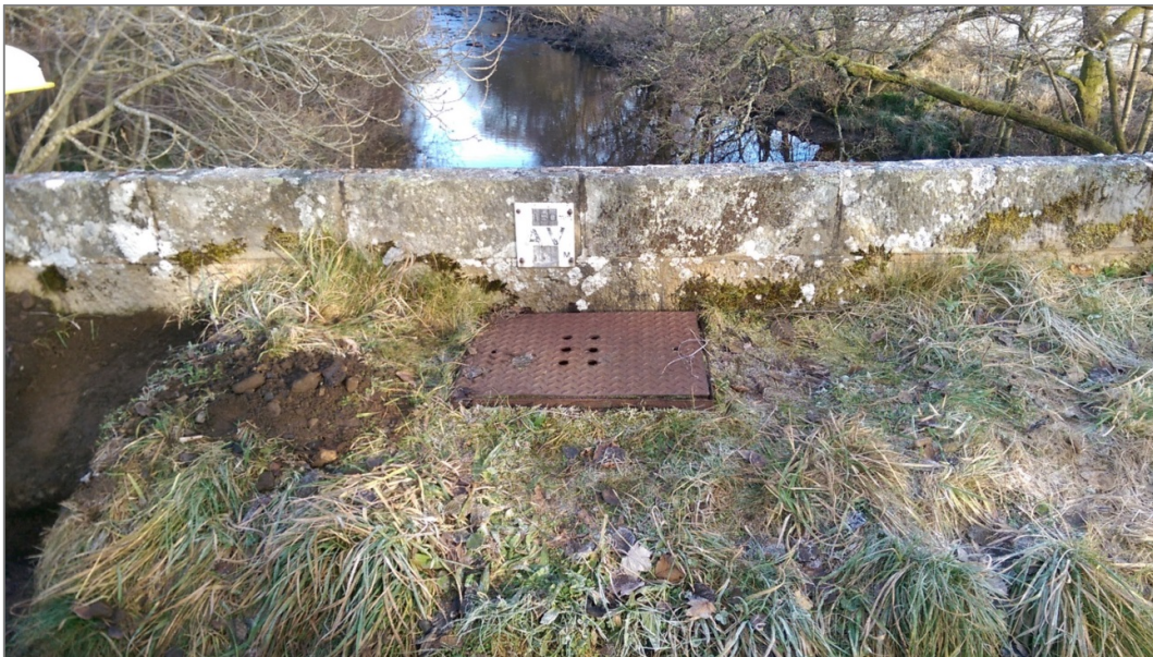
Photograph 11 – Abandoned water main cover to the Upstream verge (05/12/2016).