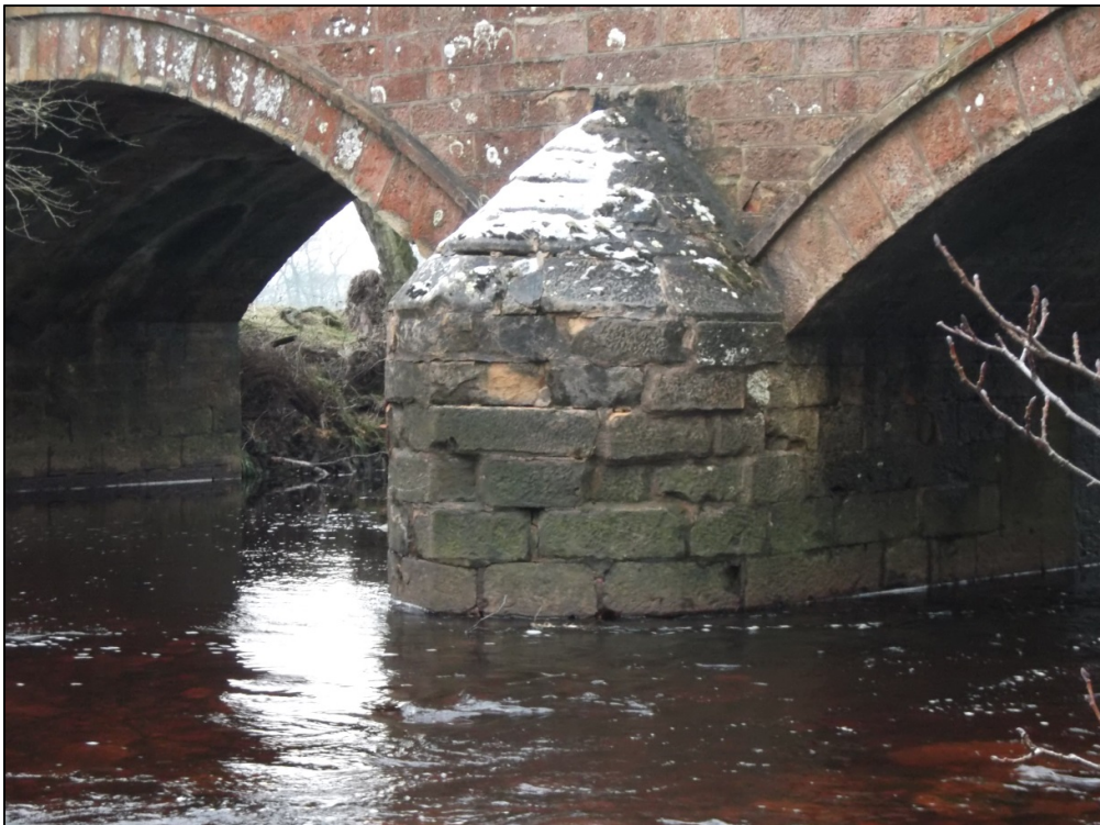
Photograph 9 – Open joints in east pier upstream cutwater, note evidence of recent spalling