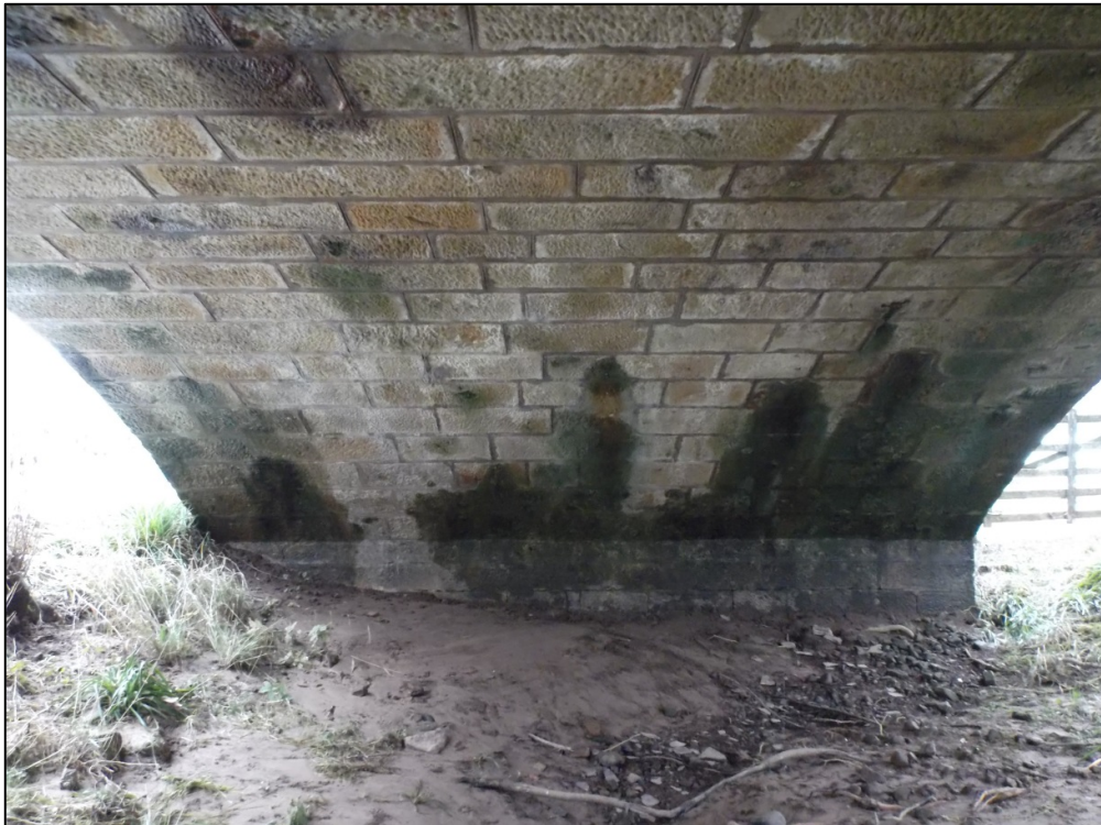
Photograph 2 – Dampness and staining to arch barrel masonry of north abutment