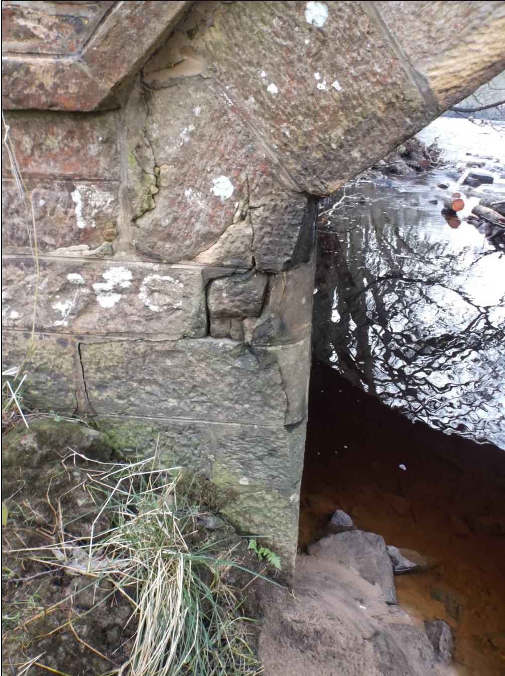
Photograph 7 – Masonry crushing at south abutment springing