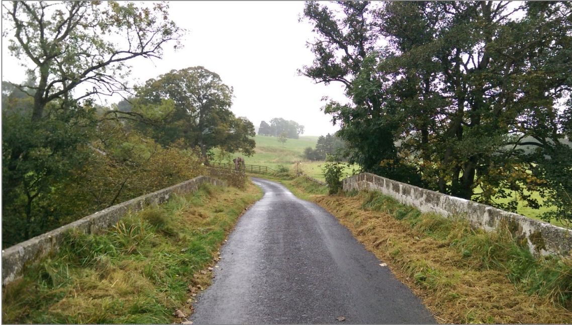
Photograph 1 – Poor surfacing and vegetation growth in verges looking southeast over bridge (16.10.2016)