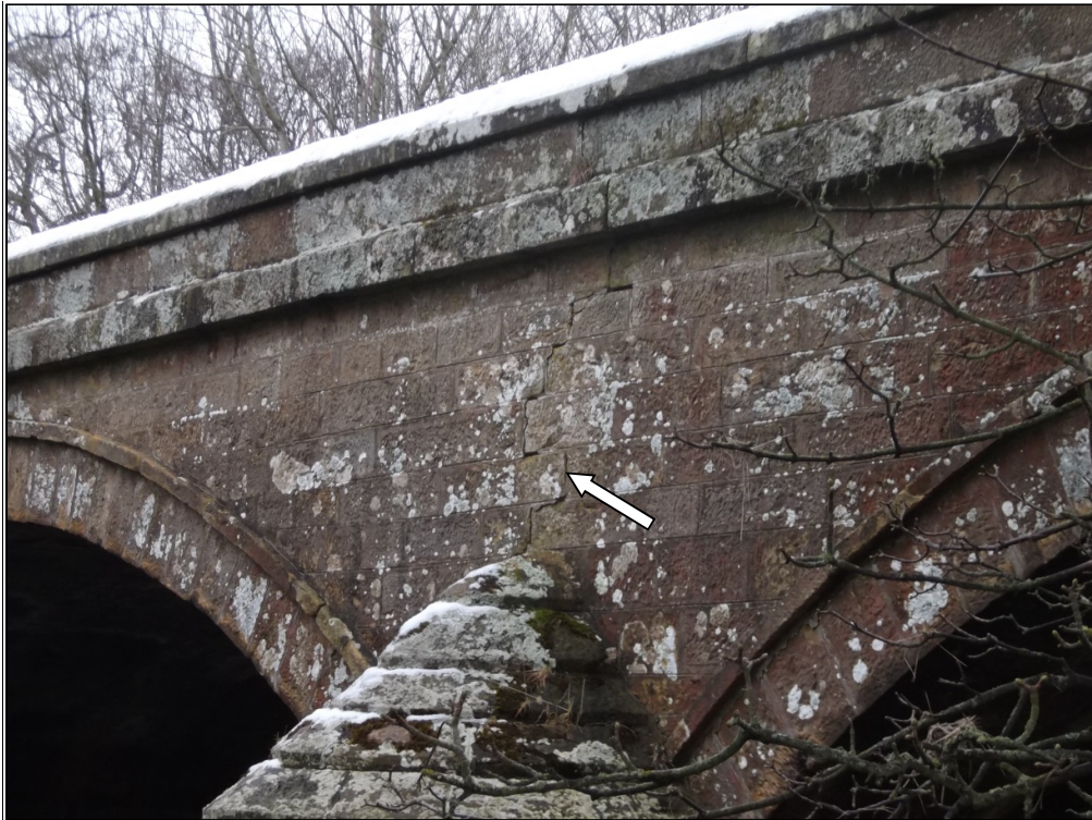
Photograph 4 – Crack above east pier to downstream elevation