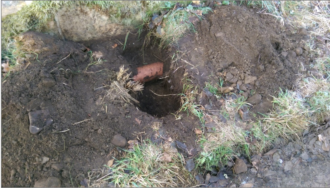
Photograph 10 – Downstream verge BT duct (05/12/2016).