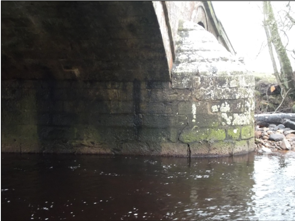
Photograph 8 – Crack and open joints to east pier downstream cutwater