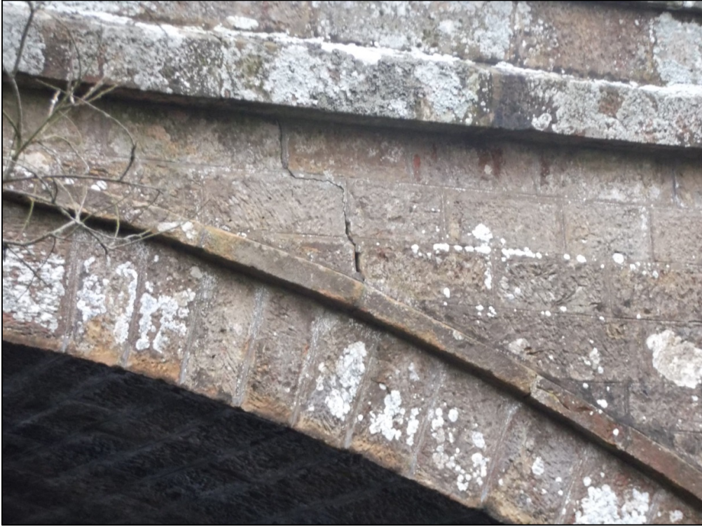
Photograph 5 – Crack in centre span spandrel to downstream elevation