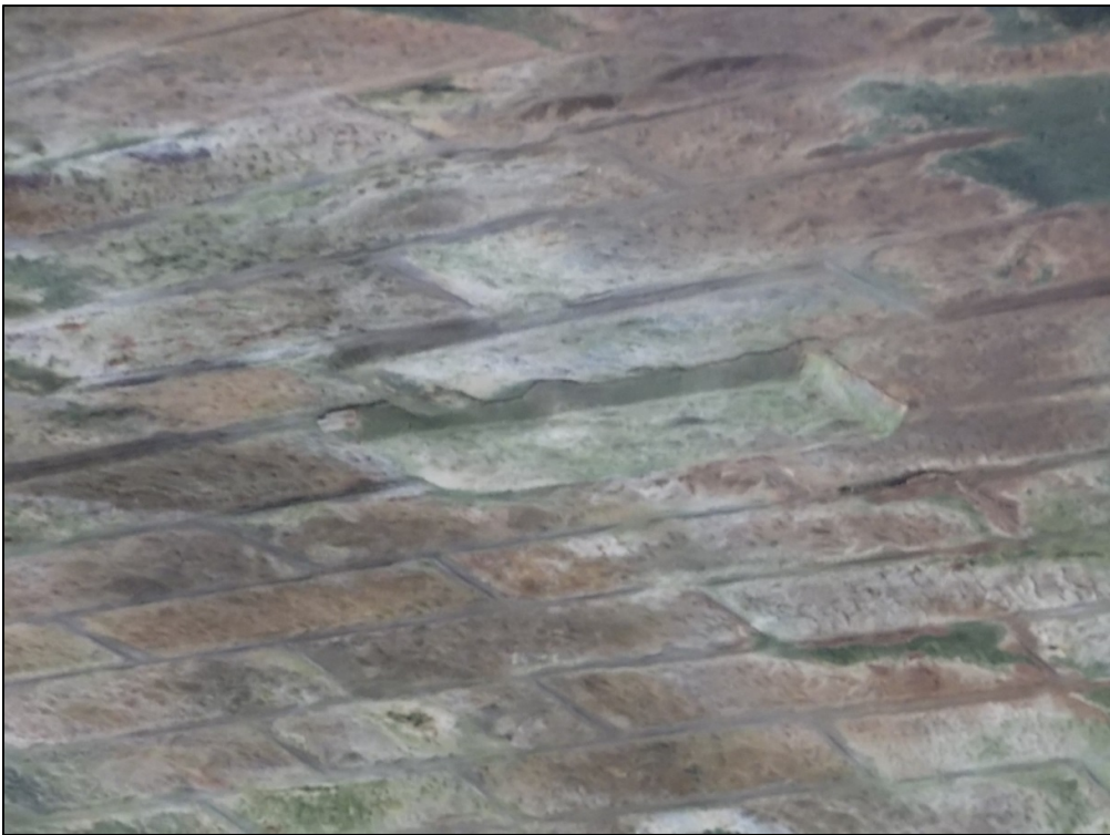
Photograph 6 – Displaced masonry block to south span arch crown