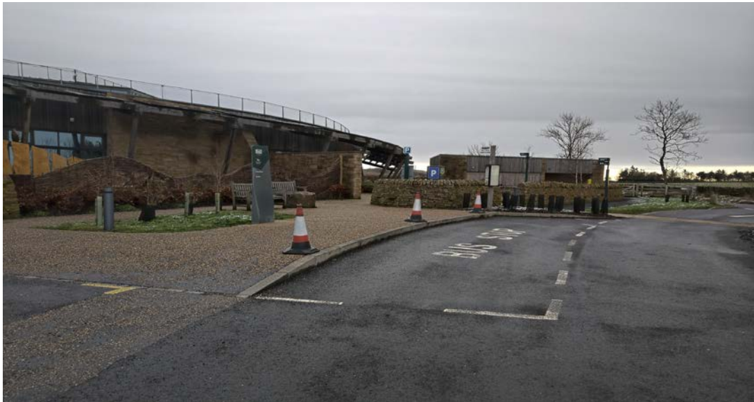
Figure 4: Location of proposed bollard