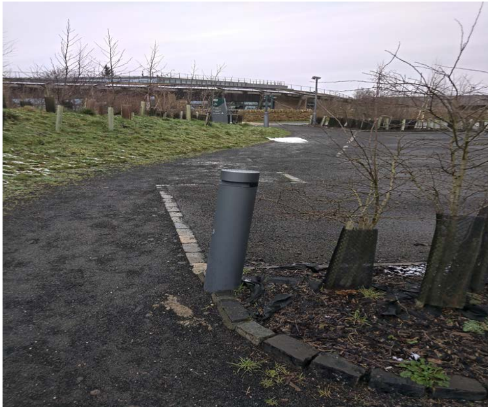
Figure 3: Existing bollards of similar design on site

Bollards of a similar height, design and finish are already in place on site. This confirms that the proposal would reflect the local vernacular that it would form part of.