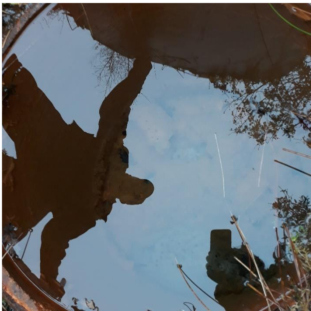
Spring chamber - internal