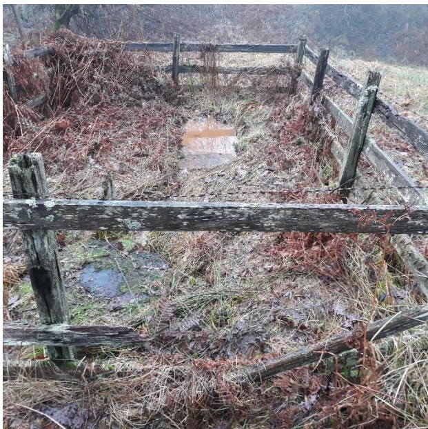
Spring chamber and tank beyond