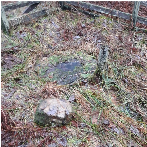
Lid of spring chamber