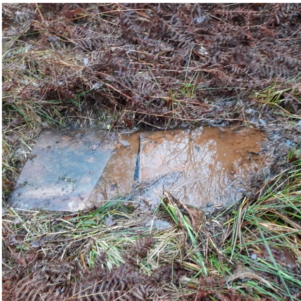
Stone covers across open tank