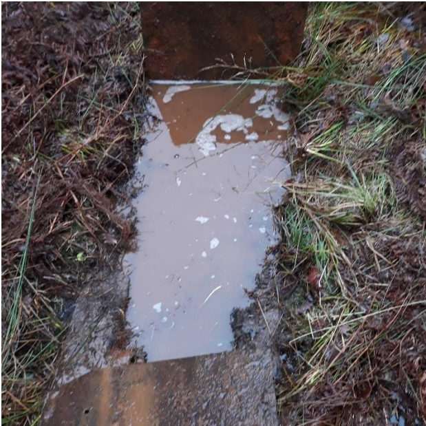
Tank - internal