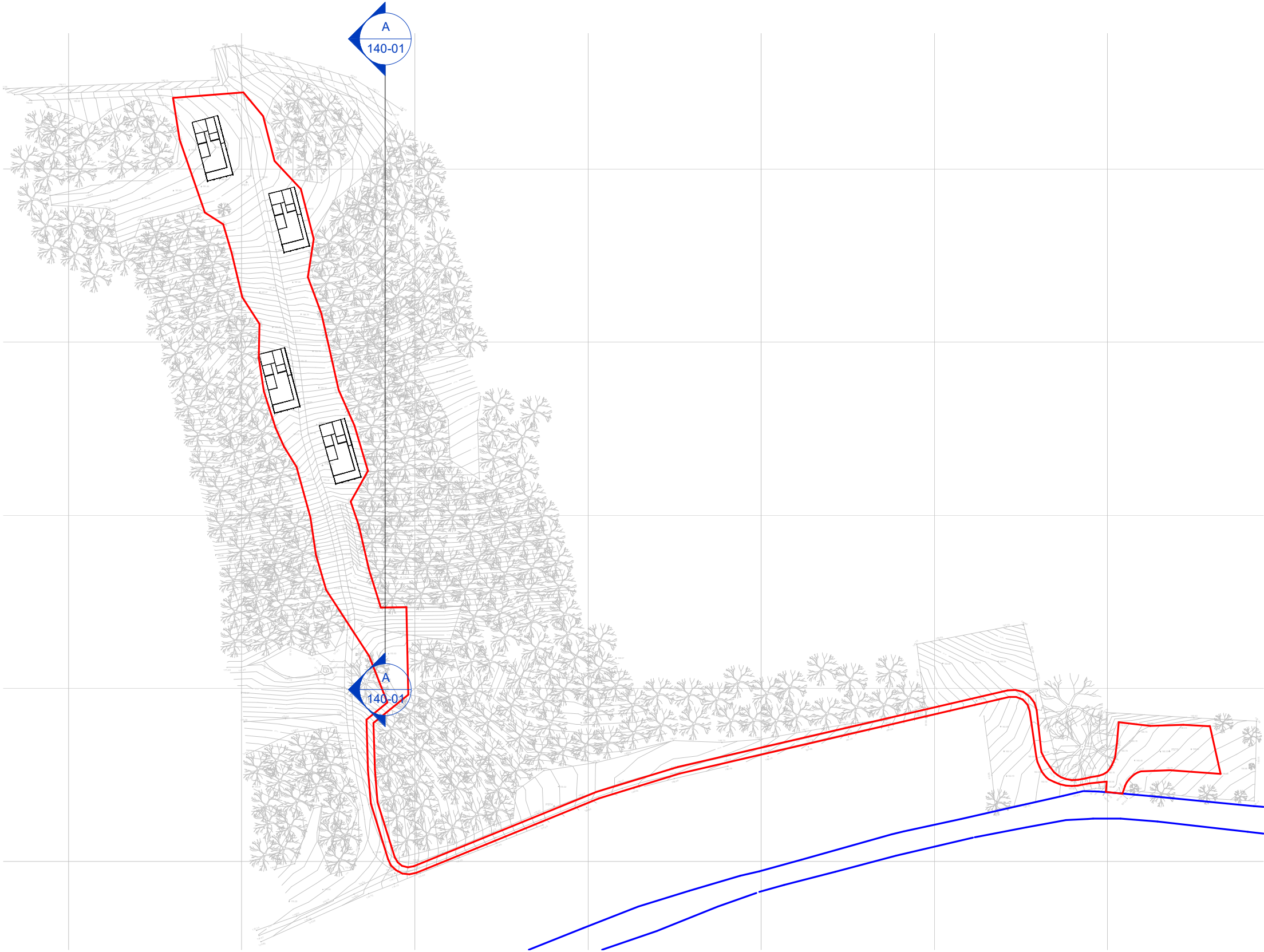
Proposed Section Key 1 : 1250