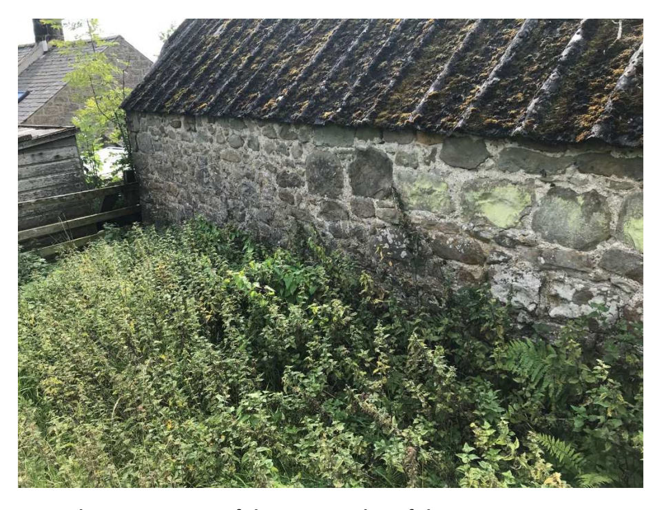
P3 – Asbestos cement roof sheets to north roof slope