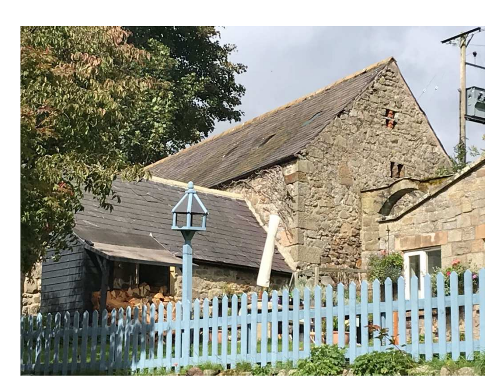
P6 – Residential use to east of site