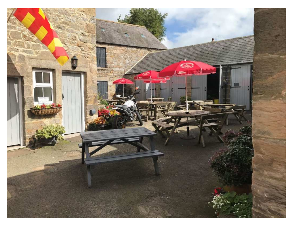
P2 – View of hard paved courtyard from road entrance