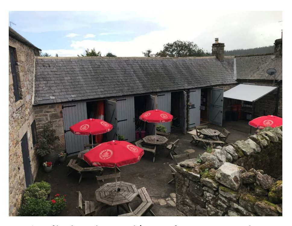
P1 – View of hard paved courtyard / garages from upper rear garden