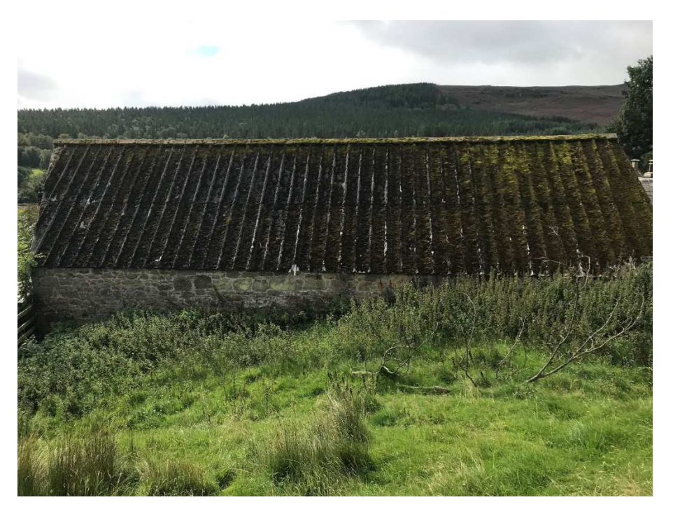
P5 – Rear agricultural field to north of site