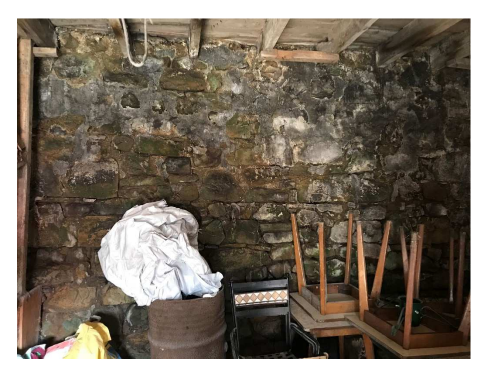
P4 – View of interior of former stables