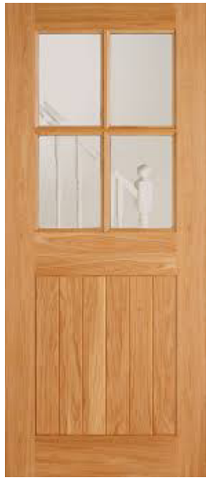
Proposed entrance door to match existing Kitchen door