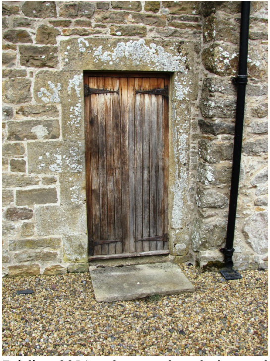
Existing 2016 entrance door to be replaced