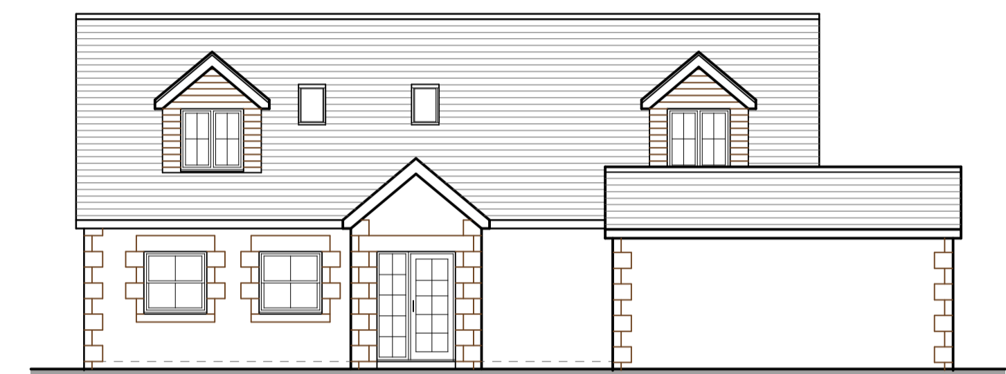
NORTH ELEVATION - HOUSE & GARAGE