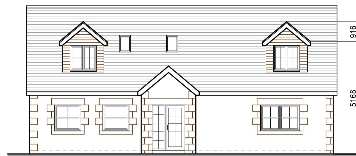
NORTH ELEVATION - HOUSE