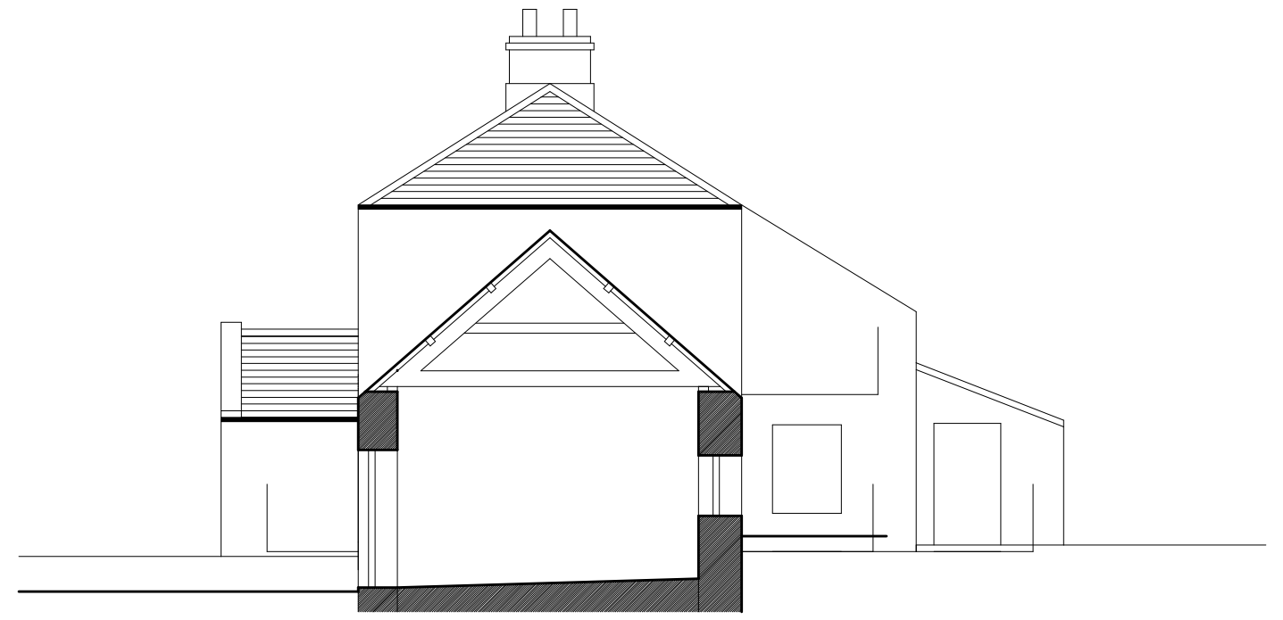
section b - b